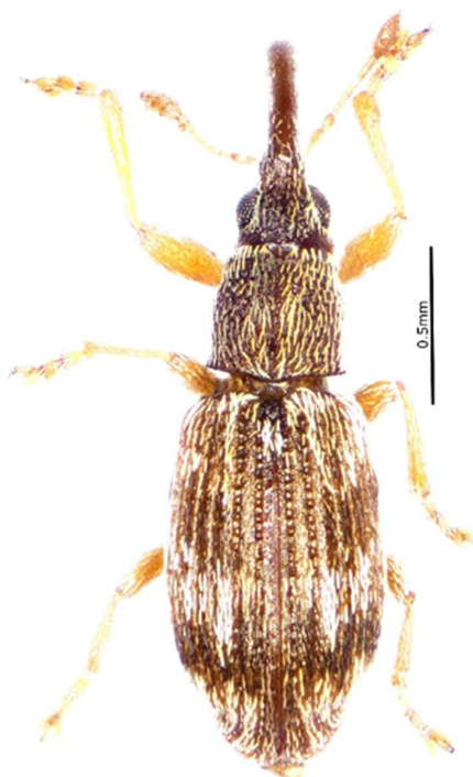
02. Taeniapion urticarium male habitus, Urtica -fen, Birlingham, Worcestershire, 13m O.D., 5 May 2019. The rostrum is somewhat shorter and more distinctly scaled than that of females.

Elsewhere it was noted on Bredon Hill in Eckington C. P. (VC37 ST9440 80m O.D.) on 6 June 2020 (04) with a more recent record at Battlesbury Hill, Warminster C. P., Wiltshire (VC8 ST8945 114m O.D.) on 11 May 2024 (05). The vast majority of these examples are female but when viewed together show a significant range of variation which is illustrated here. In particular the female from Battlesbury Hill is essentially black with the pronotal scaling almost white whereas examples from the Avon valley are paler with pronotal scaling yellowish. It is not presently confirmed whether a darkening trend of adult beetles correlates in any way with either altitude or habitat.