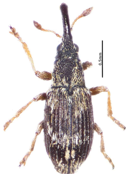
05. Taeniapion urticarium female habitus , Battlesbury Hill, Warminster, Wiltshire, 114m O.D., 11 May 2024.