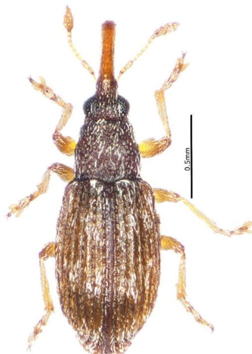
03. Taeniapion urticarium female habitus, Urtica -fen, Birlingham, Worcestershire, 13m O.D., 29 October 2023.