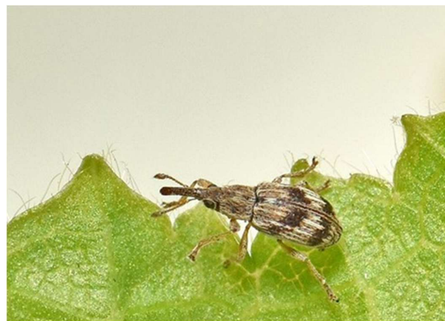
Taeniapion urticarium from Hampton, Evesham 10.09.18. Gary Farmer.

There is a record for T. urticarium from Hampton, Evesham 10.09.2018 which is not shown on NBN. The specimen was swept from nettles on the edge of a horse-grazed paddock. See below.