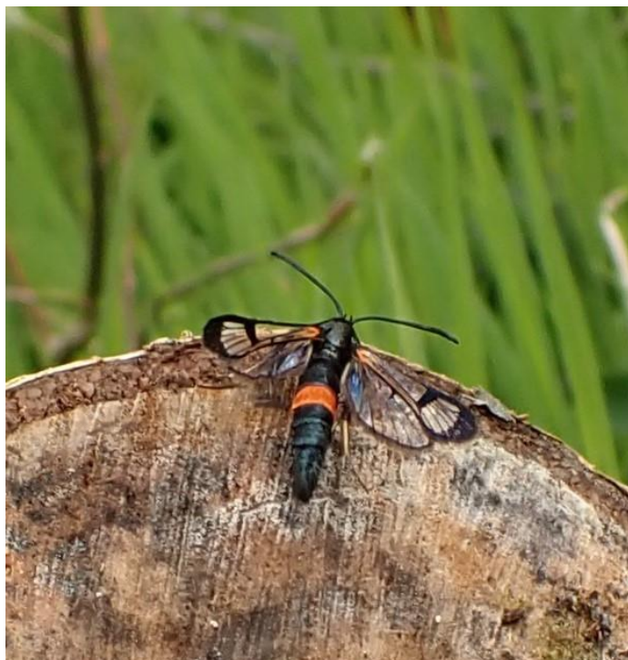
08. Large Red-belted Clearwing. Devil's Spittleful 17.05.22. Brett Westwood.

Large Red-belted Clearwing Synanthedon culiciformis (L.) (08) Brett Westwood saw five around birch stumps in the day at Devil's Spittleful SO805748 on 17/05/22, confirming its presence at this site after possible old emergence holes were found there in the past.