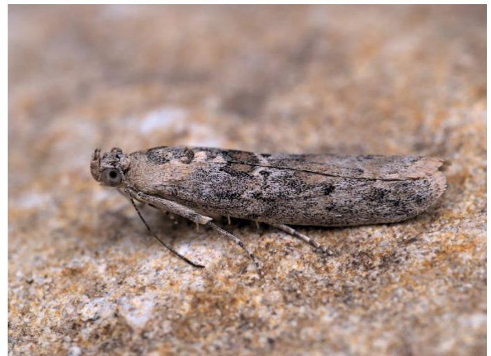
03. Ancylosis oblitella Norchard 14.08.22. Mike Southall.

A single specimen of this uncommon migrant was recorded at light at Norchard SO84686849 by Mike Southall on 14/08/22.