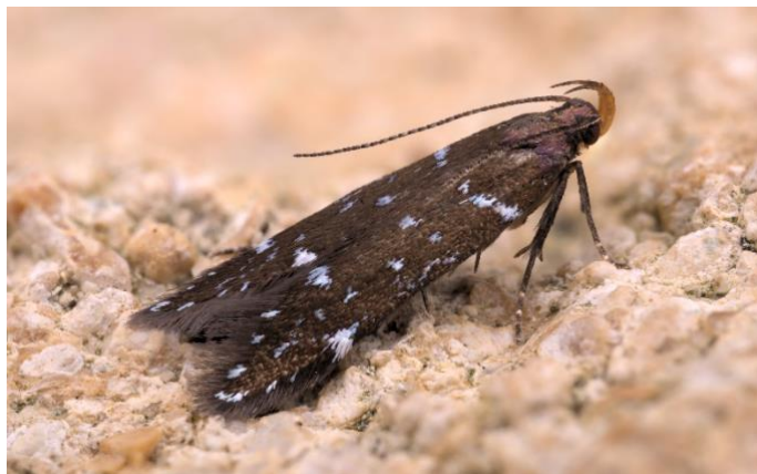
10. Argolamprotes micella Childswicham 16.06.22. Could be heading to VC37. Oliver Wadsworth.

Last year, I (OW) recorded the attractive and reasonably distinctive Gelechiid Argolamprotes micella (10) just over the boundary in VC33. It has been slowly marching north since its arrival in Britain in 1963 and I suspect it will turn up in Worcestershire before long.