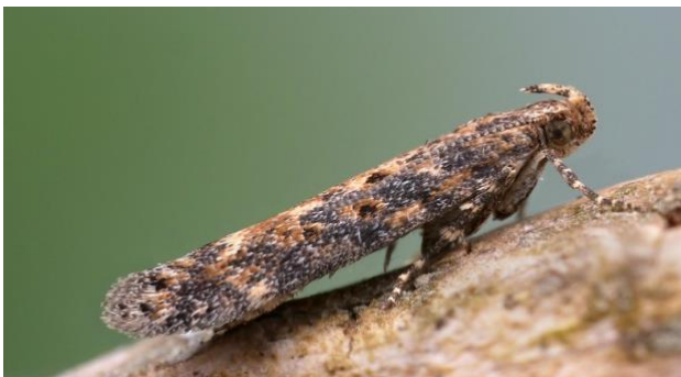
01. Scrobipalpa ocellatella Childswickham 12.08.22. Oliver Wadsworth.

2022 saw large numbers of this moth turning up at light right across the U.K. Usually coastal and confined to Sea Beet Beta vulgaris subsp. maritima in localities in the south and east. It is suspected that the 2022 influx were all migrants but their origin is uncertain. There were 96 specimens recorded from 16 different sites right across the county between 12/08/22 and 08/09/22.