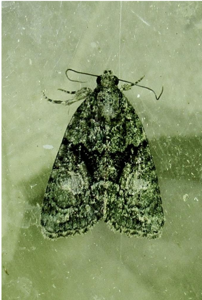
05. Tree-lichen Beauty Hall Green 07.08.22. Alan Prior.

This formerly migrant lichen feeding species has become resident in south-east England and has been spreading northwards, with two reaching eastern VC37 last year. Gavin Peplow had one at light at Abberton SO995563 on 02/08/22 and Alan Prior another at Hall Green SP10478292 on 07/08/22. This species may well continue to spread further into the county.