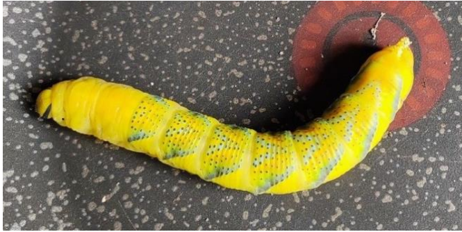
01. Death's Head Hawk Moth caterpillar 30.08.23.