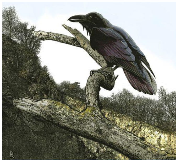
01. Raven

The lack of records from the Tenbury Wells area (despite some searching) implies an absence of information and not an absence of Raven pairs or suitable habitats. As always, I would really welcome any observations from Worcestershire Record readers about possible nest sites.