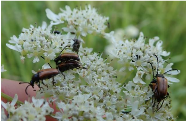
01. Five Pseudovadonia livida on one flower head 23.06.19.