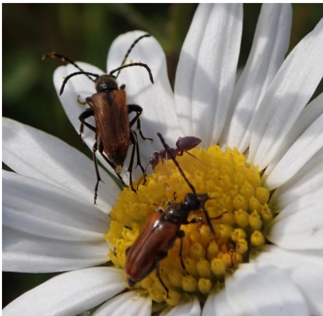
02. Pseudovadonia livida. Mating pair and another on Ox-eye daisy with an ant for scale 21.06.19.