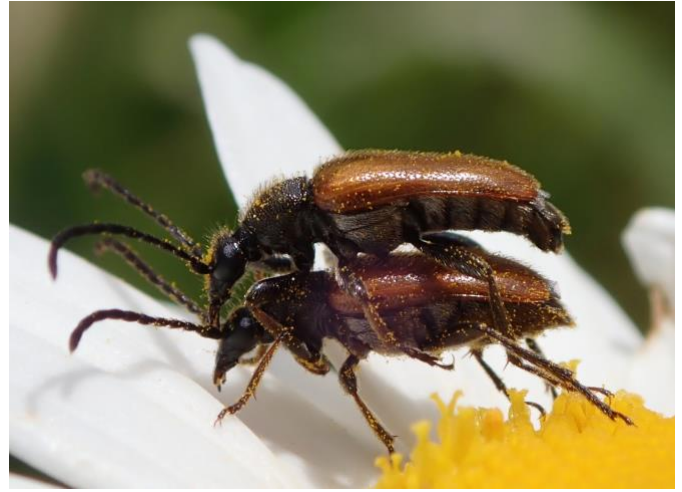
03. Pseudovadonia livida mating pair 03.06.19. Jean Young.

We did not cover the whole field, but estimate that we spent 20-30 minutes looking which was sufficient to see that they were having another good year! It will be interesting over the next few years to monitor the numbers to see whether conditions continue to be favourable for the beetles. It seems unlikely that this is the only field with such an abundance of Pseudovadonia livida so when you're out for a walk and come across grasslands with fairy-rings it may be worth making a note to go back and check in the Summer. Your challenge is to beat 368!