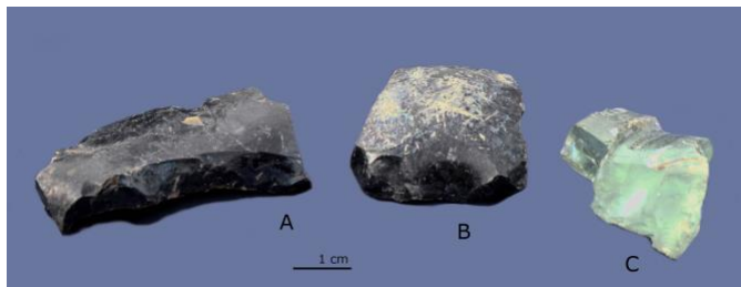
01 A, B & C, post-medieval bottle glass scrapers from the Vale of Evesham. A, Greenhill, Evesham, 25 April 2020; Little Comberton B on 16 June 2020 and C on 12 May 2020.

Two aqua glass tools and a black glass tool were found at Little Comberton (52°08'N 02°05'W SO9643) on 12 May 2020 and 16 June 2020 respectively. One aqua glass tool is a notched scraper (03) worked on a body fragment of an angular bottle marked 'GL.....' and believed to be a Baird's (of Glasgow) pickle jar dating from about 1920. The other is a thick scraping tool (01C) worked on the lid of a fruit-preserving jar made in Bristol and also believed to date from about 1920. The black glass tool (01B) is a thick utilised scraper worked on a base sherd from an 18 th century black glass sack bottle.