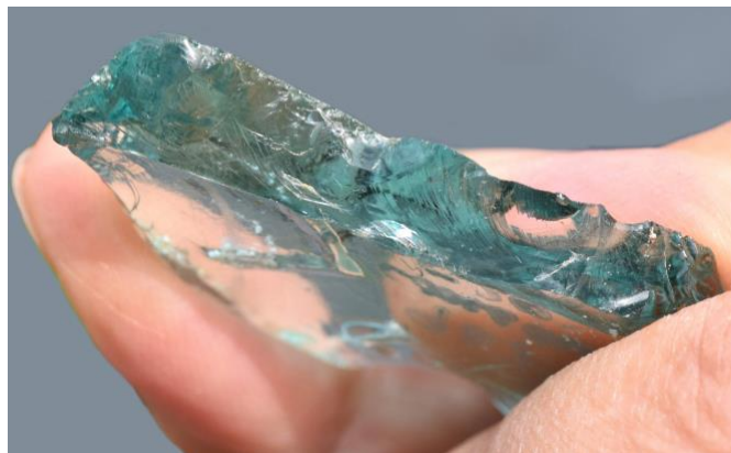
03. Post-medieval aqua glass scraper, Little Comberton, 12 May 2020, showing details of the scraping edge and use of the index finger rest.

The scraper illustrated in 03 is fabricated to allow for pressure from the index finger to be applied uniformly and in this way it resembles another glass artefact also from Greenhill, Evesham (Whitehead, 2017).