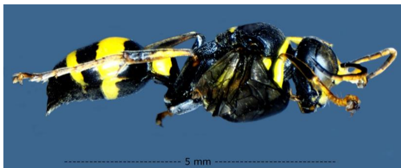
02. Lestiphorus bicinctus , Evesham, Worcestershire, 8 July 2019. Habitus, lateral.