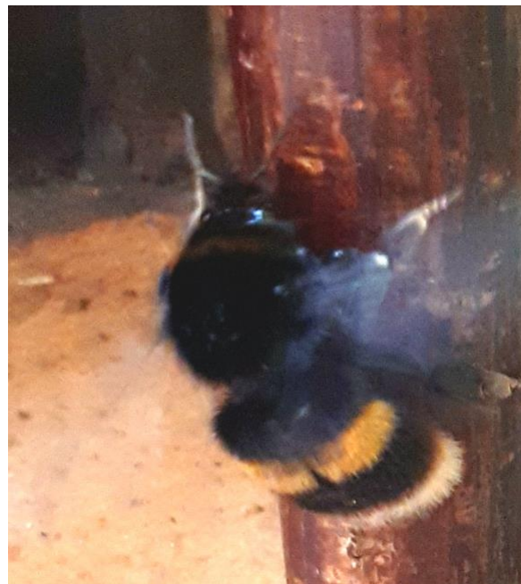
02. Unusual bumblebee.