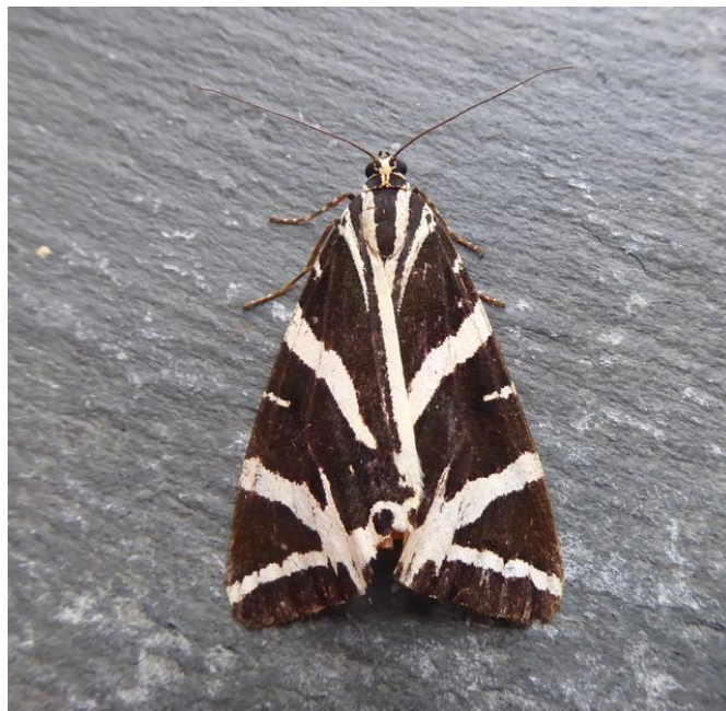
04. Jersey Tiger Euplagia quadripunctaria.