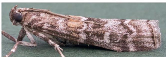
02. Dioryctria sylvestrella.