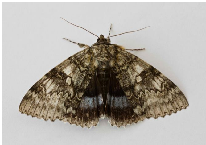
05. Clifden Nonpareil Catocala fraxini.