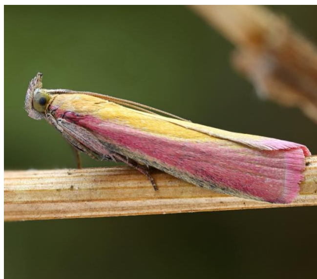
04. Oncocera semirubella.