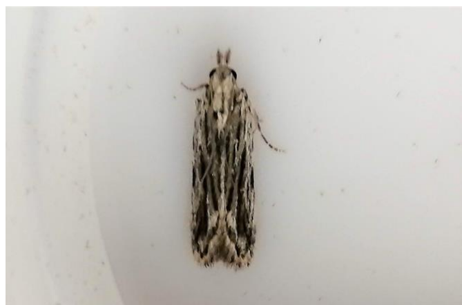
02. Anarsia innoxia.