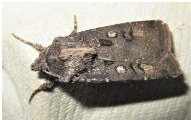
07. Crescent Dart Agrotis trux . Alan Prior.

Crescent Dart Agrotis trux (Hb.) Another surprise vagrant which is usually almost entirely confined to coastal habitats turned up in Alan Prior's moth trap in Hall Green SP10478292 on 29/7/20.