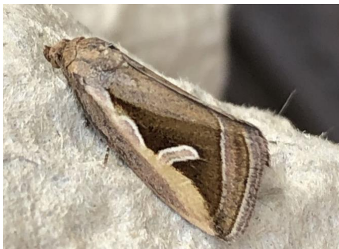
06. Silver Hook Deltote uncula . David Throup.

Silver Hook Deltote uncula (Cl.) David Throup caught one at light at Powick SO819508 on 13/5/20. A species of wet boggy habitats it was certainly a vagrant at this site. The nearest known site is Sutton Park in Sutton Coldfield.