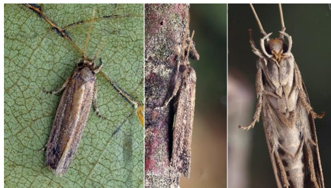
01. Opogona omoscopia.