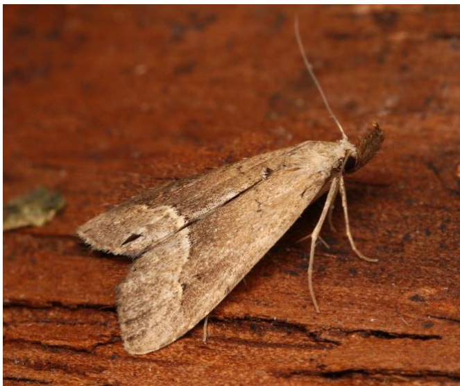
06. White-line Snout Schrankia taenialis . Oliver Wadsworth

Oliver Wadsworth had a White-line Snout Schrankia taenialis (Hubner) (06) come to actinic light at Blackhouse Wood SO73375180 on 5/8/16, which is likely to be an overlooked resident. There are some records for southern Herefordshire and this record seems to be an extension of those.