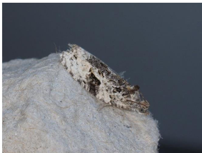
03. Apotomis lineana.