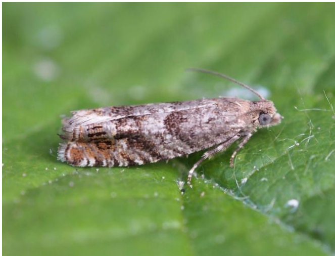
04. Epinotia pygmaeana.