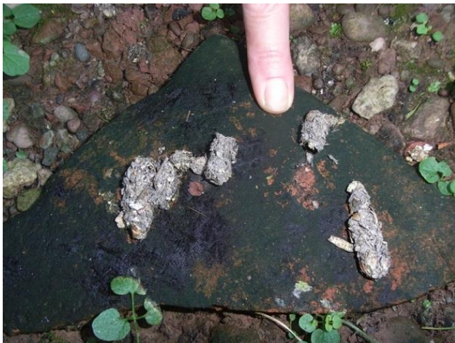
02. Otter spraints.

All records that are submitted to WMG, which also get sent to the Worcestershire Biological Records Centre (WBRC) automatically, are important in gaining a better understanding on the mammal distribution across the county.