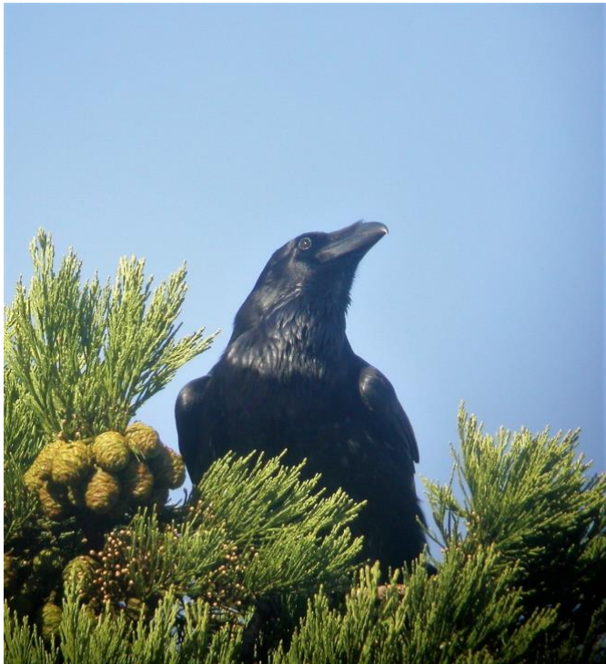
01. Raven digiscoped from my flat in Worcester in November 2012.

There are some glaring gaps in this summary of breeding sites, notably Wyre Forest, around Tenbury Wells and the exact status of ravens on the Malverns. These gaps will become a focus for 2017. Another interesting feature of this summary is the apparently poor fledging success of some nests, for which I have no obvious explanation. Once again, I invite readers of Worcestershire Record to send me any comments or observations to the email address above. Many thanks in advance.