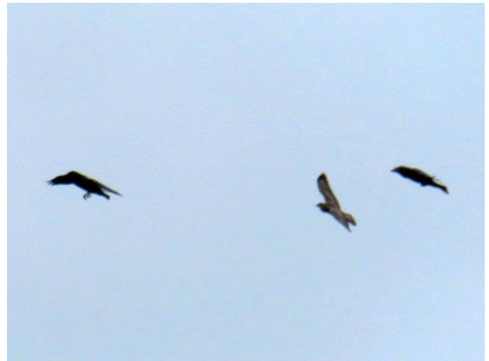
02. Ravens.