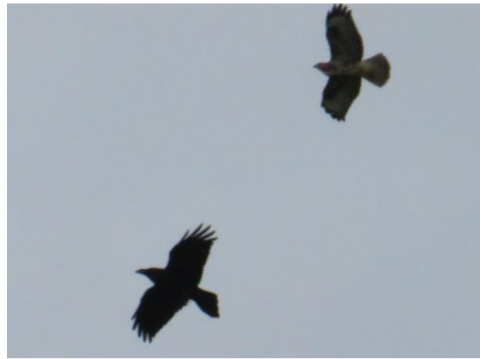
01. Ravens. Mike Metcalf

The map (01) locates both confirmed breeding sites (where adults and the nest, or with young were observed) and possible breeding sites (where adults were displaying territorial behaviours by a suspected nest site). At this stage the “confirmed” epithet refers to a pair’s breeding attempt and not necessarily to successful fledging. Information on the latter is incomplete.