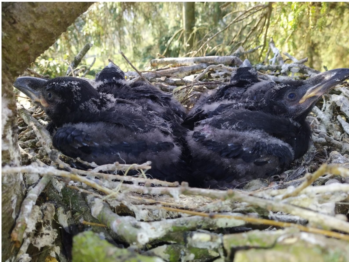
Young Ravens in the nest. photographed by licenced bird ringer on visit to ring the birds. Paul Ashworth.

As we all know, there was another lockdown at the start of 2021, but it was possible to visit some former nest sites from late February onwards. Once again, Record readers sent me their own observations and a map of the distribution of breeding pairs of Ravens could be constructed. All those who helped are acknowledged below.