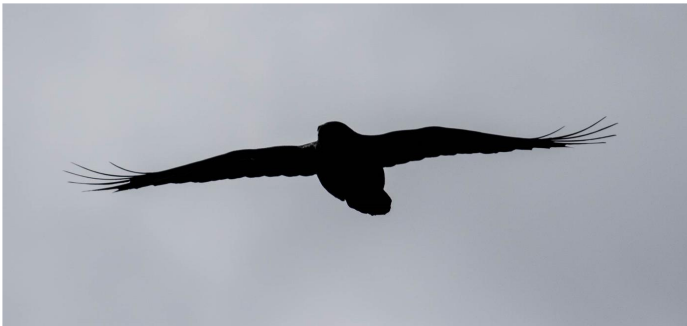
01. Raven Corvus corax at Croome, March 2020.