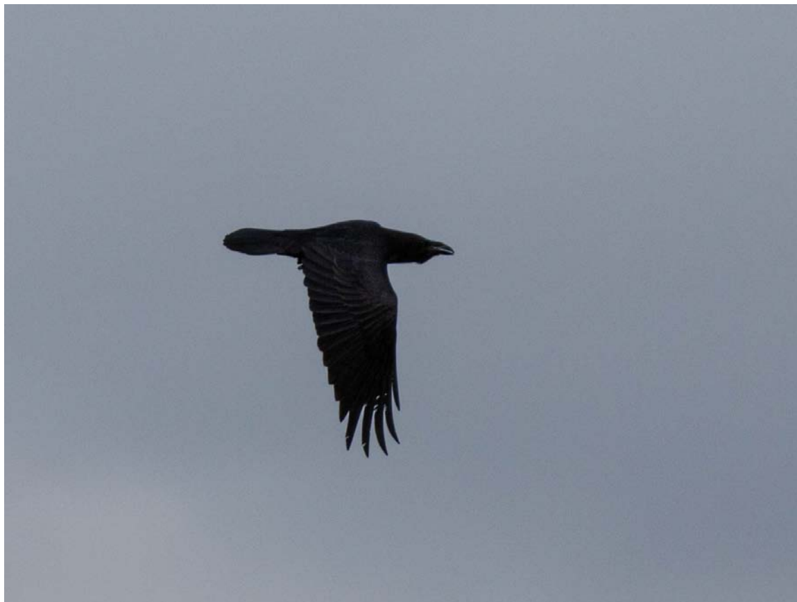
Raven at Croome March 2020. Dave Hull.

As the network of observers and observations has grown additional pairs can be added retrospectively.