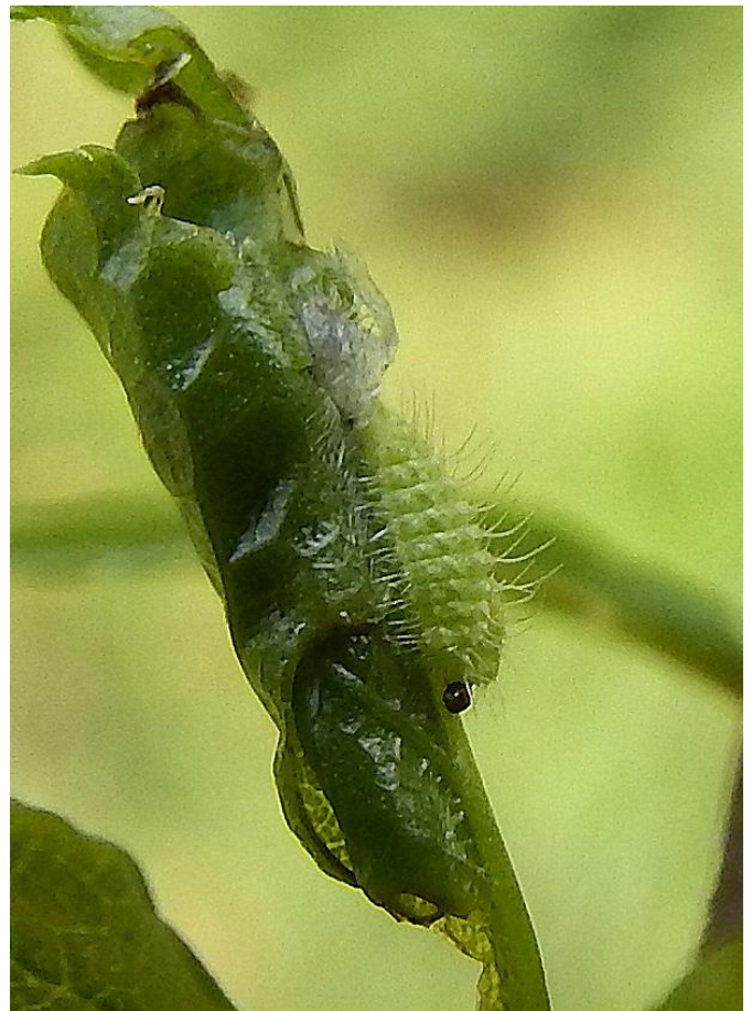
04. Fully emerged 2 nd instar Brown Hairstreak larva.