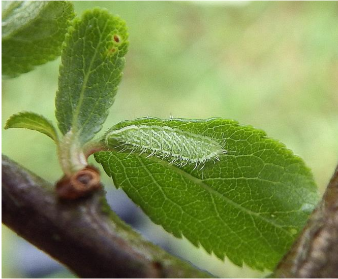
05. Brown Hairstreak larva around 30 days old c 6 mm. Paul Meers