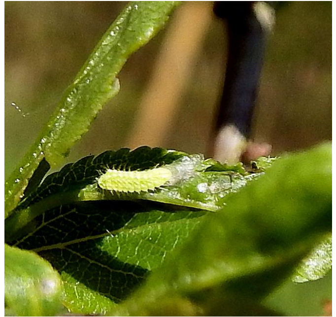
03. 2 nd instar Brown Hairstreak larva nearly out of the 1 st instar skin. Paul Meers

Around 10-14 days later, weather dependant, it emerges from the leaf bud still as a rather ordinary tiny caterpillar. It moults (02, 03), shedding its original skin to become the 2 nd . instar larva about 3 mm long, now a distinctive Brown Hairstreak caterpillar (04).