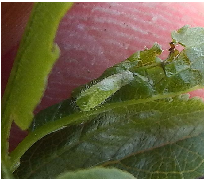
02. 2 nd instar Brown Hairstreak larva starting to emerge from 1 st instar skin. Paul Meers.

It will then grow, feeding on the Blackthorn leaves, until it is approximately 15-20mm in length. It moults twice more (3 rd and 4 th Instars) during growth and at around 40-60 days after hatching the caterpillar changes to a mottled purple colour and moves down the main stem of the Blackthorn to ground level to find a suitable pupation place, often in cracks in the ground or under leaf litter, where it will stay until the adult butterfly emerges in August or early September.