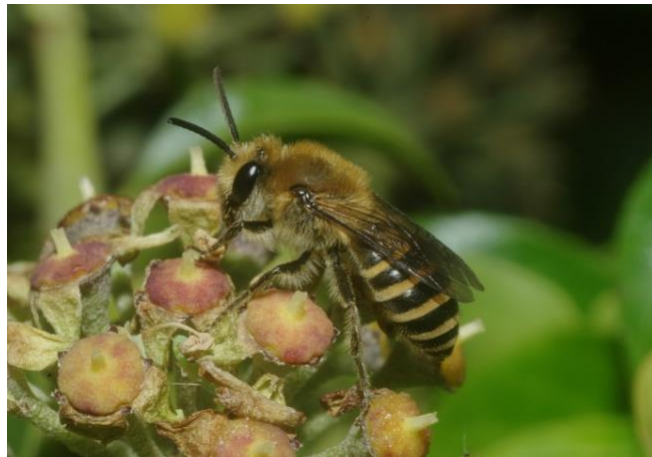
1. Colletes hederæ photographed on Ivy at St. Austell in Cornwall.

Colletes hederæ (Hym; Colletidae). My first and only Worcesterhire record to date is of one briefly seen on Ivy flowers at Martley church on 04.10.2016. (Editor's note: large numbers of this bee were recorded in Worcestershire in 2016 including several large colonies, mostly in central and south of the county)