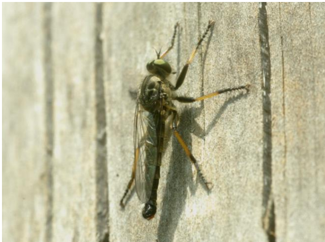
9. Neoitamus cyanurus.

Oxycera rara (Dip; Stratiomyidae). One was briefly seen on Bramble foliage at Martley Millennium Green on 06.07.2016.