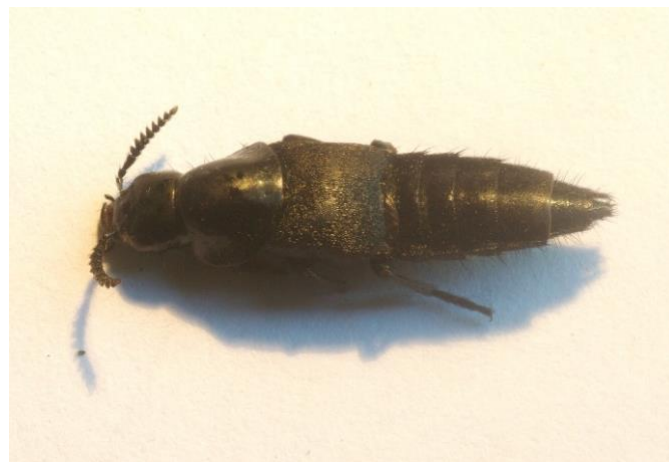
03. Velleius dilatatus . Kevin McGee. A dead specimen that was too dry and brittle to be set. Apologies for the poor photo. Broken flashgun!

Velleius dilatatus (Col; Staphylinidae). Endangered. A dead specimen was found inside a house close to Monkwood on 27.09.2016. There are very few records of this spectacular rove beetle from the midlands generally. Also known as the Hornet Rove Beetle, V. dilatatus is entirely associated with Hornets' nests where adults and larvae feed on detritus within the nest. Adults have also been recorded feeding nocturnally at sap runs on trees close to hornets' nests. An active hornets' nest was known to be in the roof-space of the house where the specimen was found. This species may be expanding its range in line with the recent range-expansion of hornets.