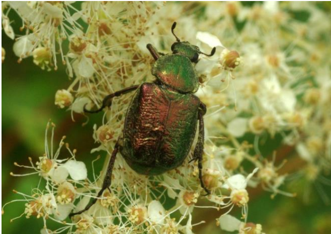
05. Gnorimus nobilis on Meadowsweet.

Gnorimus nobilis (Col; Scarabaeidae). Vulnerable. One was on Meadowsweet flowers at Martley 'Millennium Green' on 21.07.2016.