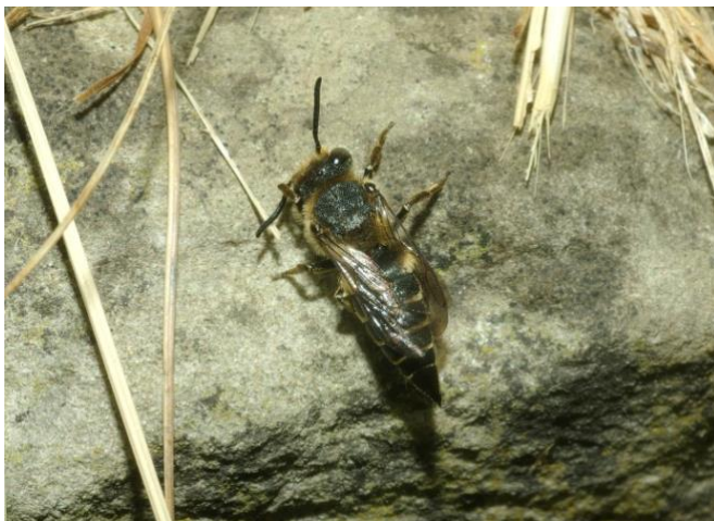
10. Coelioxys rufescens at Martley Church. Kevin McGee.

Coelioxys rufescens (Hym; Megachilidae). One female collected from a low wall alongside Martley Church on 10.06.2016.