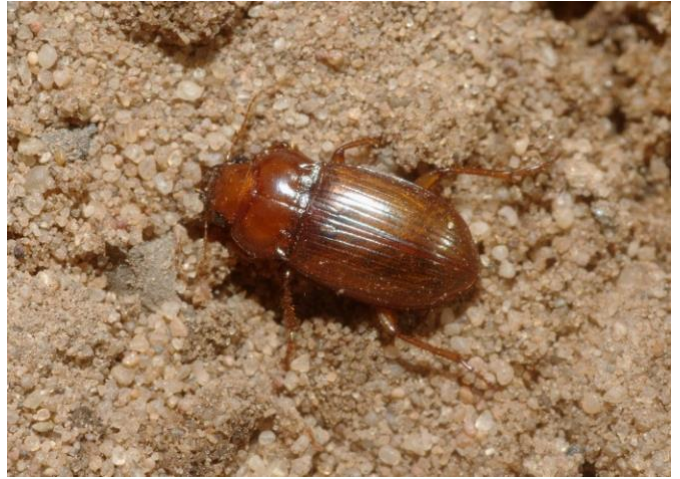
07. Amara fulva on a sandy track.

Amara fulva (Col; Carabidae). Notable B. One was collected from sandy ground at Devil's Spittleful on 29.05.2016.