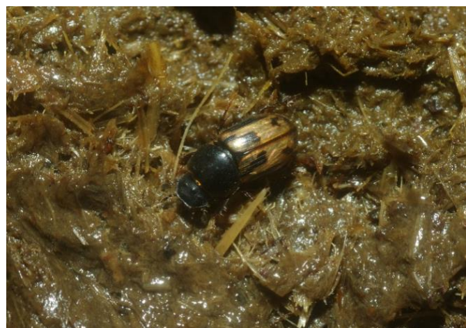
04. Aphodius distinctus in cow dung. Kevin McGee.

Aphodius distinctus (Col; Scarabaeidae). Notable B. One of five was collected from cow dung at Devil's Spittleful on 11.03.2016.