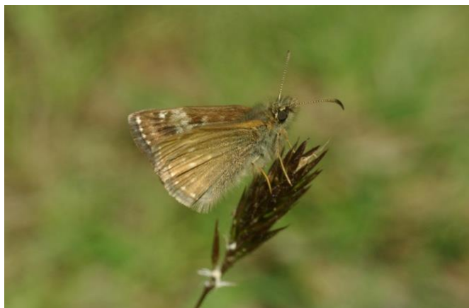
02. Dingy Skipper at Dowles Brook, Wyre Forest. Kevin McGee.

Dingy Skipper. One was at the western section of Wyre Forest just across the border in Shropshire alongside Dowles Brook on 08.05.2016.