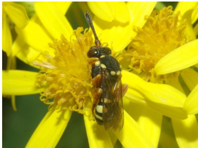
12. Nomada flavopicta on Ragwort flowers at Martley church.

Nomada flavopicta (Hym; Apidae). Notable B. One of two females collected from Ragwort flowers at Martley church on 29.07.2016. This is my first and only record of this scarce species to date.