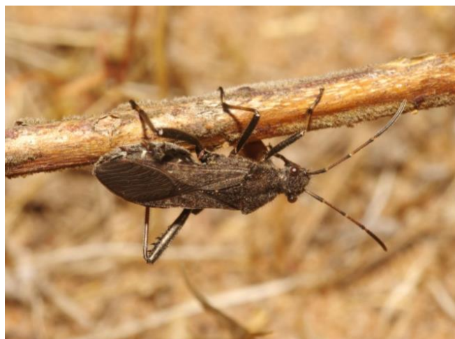
13. Alydus calcaratus at Devil's Spittleful on 21.07.2018.

Several were seen actively moving across the ground in a sandy section of the Devil's Spittleful during hot sunny weather on 21.07.2018. I have never seen them here previously, but I do have records from similar habitat at Hartlebury Common in 2001 and 2003.