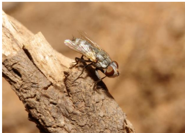
11. Senotainia conica at Devil's Spittleful on 30.06.2018.

uniglumis at Devil's Spittleful, or if they are using other bees and wasps as hosts.