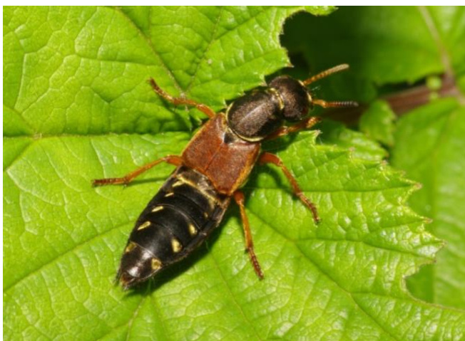
06. Staphylinus dimidiaticornis at Martley Millennium Green on 31.05.2018.