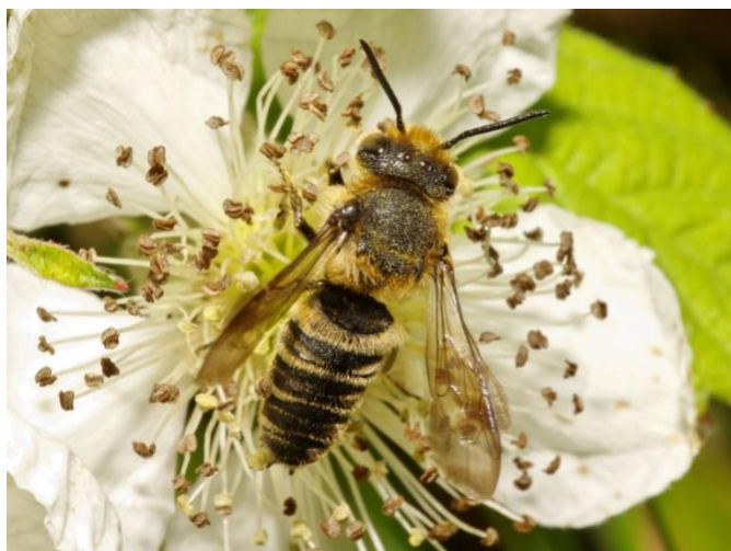
14. Coelioxys elongata (male) at St. Peters Church, Martley on 15.06.2018.

One male collected from bramble flowers at St. Peters church in Marley on 15.vi.2018.