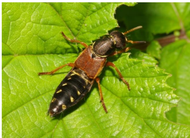
06. Staphylinus dimidiaticornis at Martley Millennium Green on 31.05.2018.