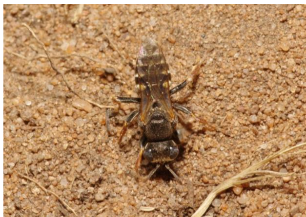
12. Oxybelus uniglumis (female) excavating a burrow at Devil's Spittleful on 30.06.2018.

Sericomyia silentis (Dip: Syrphidae). I was surprised to encounter two females visiting ivy flowers at St. Peters church in Martley on 28.09.2018.