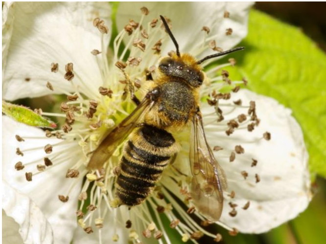
14. Coelioxys elongata (male) at St. Peters Church, Martley on 15.06.2018.

One male collected from bramble flowers at St. Peters church in Marley on 15.vi.2018.