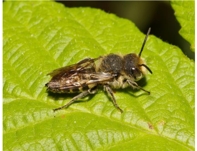
15. Coelioxys inermis (male) at St. Peters Church, Martley on 21.06.2018.

One collected from a low wall at St. Peters church in Martley on 21.06.2018.