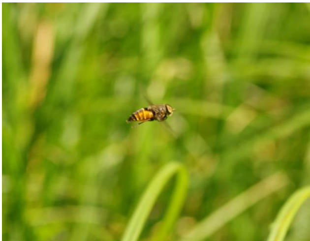
10. Hybomitra distinguenda (male) at the Mackeness Reserve, Wyre Forest on 23.06.2018.