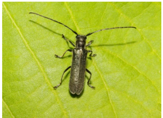
04. Stenostola dubia at Shakenhurst on 17.05.2018.

Up to five were present on the foliage of a large open-grown mature Lime tree at the Shakenhurst estate between 17 th and 26 th May 2018. A pair in-cop were noted on 19.05.2018.