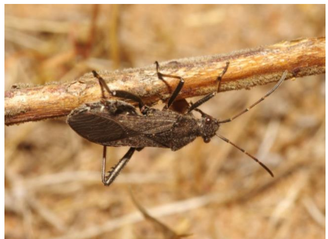
13. Alydus calcaratus at Devil's Spittleful on 21.07.2018.

Several were seen actively moving across the ground in a sandy section of the Devil's Spittleful during hot sunny weather on 21.07.2018. I have never seen them here previously, but I do have records from similar habitat at Hartlebury Common in 2001 and 2003.