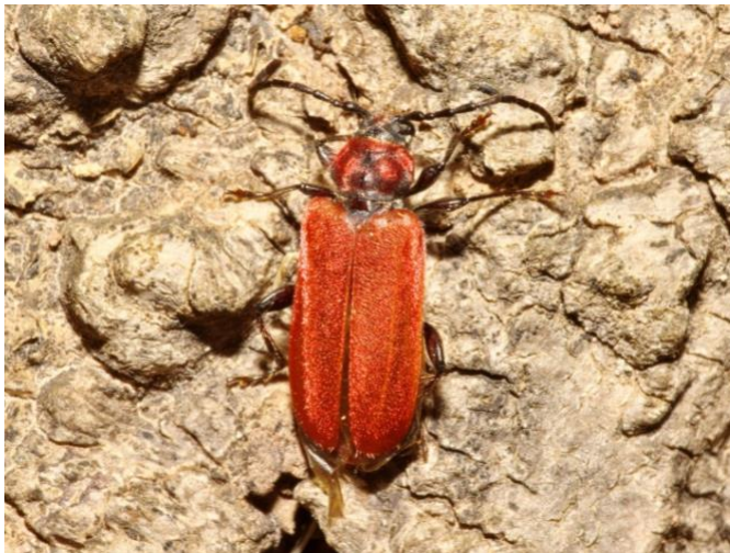
05. Pyrrhidium sanguineum on an oak log at the Shakenhurst estate on 28.05.2018.