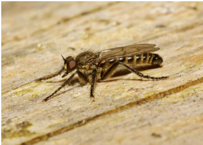
09. Lasiopogon cinctus at Devil's Spittleful on 05.05.2018.

Xanthogramma citrofasciatum (Dip: Syrphidae). One was seen briefly among ant-hills in a recently grazed area of the Devil's Spittleful on 05.05.2018. Up to five (males and females) were recorded in species-rich grassland with ant-hills alongside Lodge Hill Farm, Wyre Forest, on 19.05.2018.