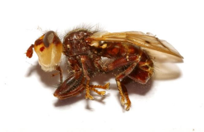
08. Myopa hirsuta from Devil's Spittleful on 25.04.2018.

One was collected from Blackthorn flowers at the Devil's Spittleful on 25.04.2018.