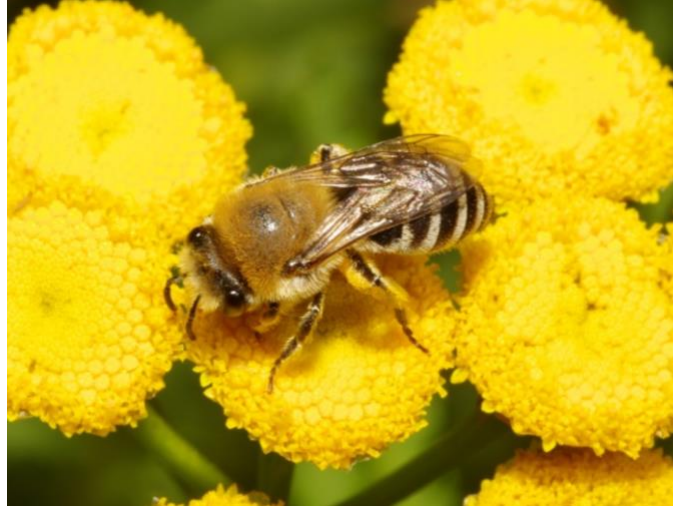
19. Colletes similis (female) visiting Tansy flowers at Devil's Spittleful on 21.07.2018.

I collected one of five females visiting Tansy flowers alongside the track leading beneath the Severn Valley Railway bridge into the Devil's Spittleful on 21.07.2018. This is my first Worcestershire record for this species.