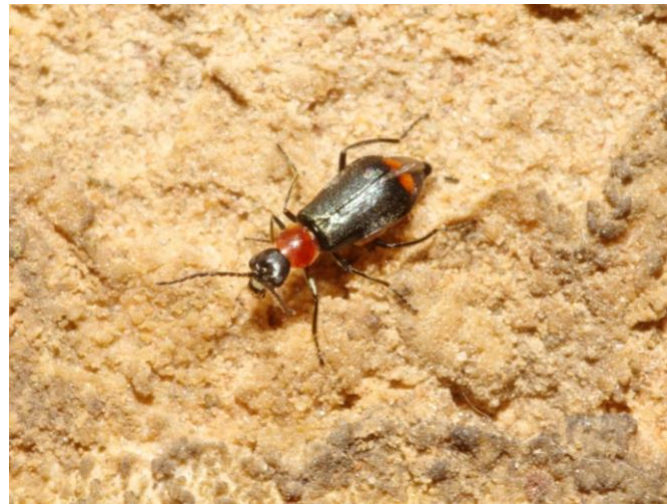
07. Axinotarsus ruficollis at St. Peters Church, Martley on 12.06.2018.

One was found at rest on the southern wall of St. Peters Church, Martley on 12.07.2018. My first record of this species anywhere.