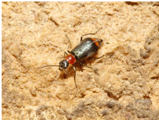
07. Axinotarsus ruficollis at St. Peters Church, Martley on 12.06.2018.

One was found at rest on the southern wall of St. Peters Church, Martley on 12.07.2018. My first record of this species anywhere.