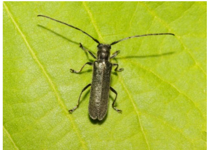
04. Stenostola dubia at Shakenhurst on 17.05.2018.

Up to five were present on the foliage of a large open-grown mature Lime tree at the Shakenhurst estate between 17 th and 26 th May 2018. A pair in-cop were noted on 19.05.2018.