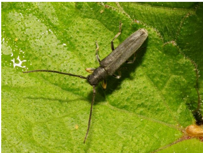
02. Phytoecia cylindrica near the Devil's Spittleful on 05.05. 2018.

One was found on Hogweed foliage alongside the track leading from Blackstone Rock car park towards the Devil's Spittleful on 05.05.2018.