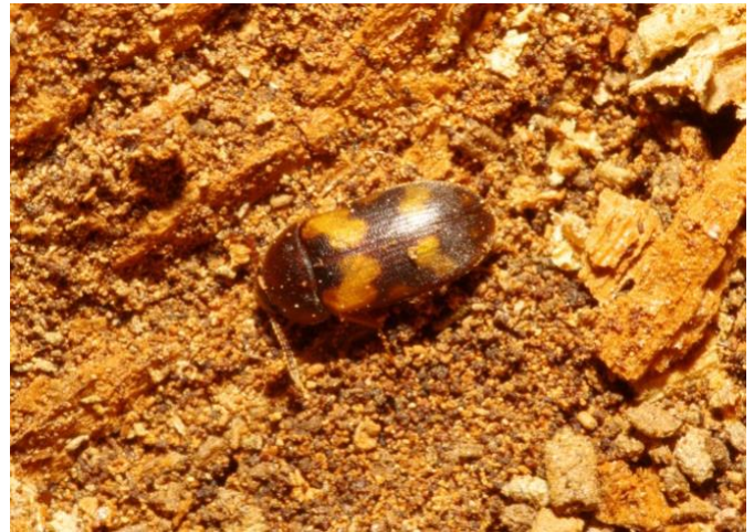
03. Mycetophagus piceus at Shakenhurst on 13.v. 2018.

One was collected from inside a very dry and crumbling part of a large and long dead oak log at the Shakenhurst estate on 13.05.2018.