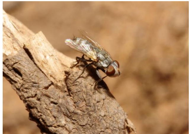
11. Senotainia conica at Devil's Spittleful on 30.06.2018.

uniglumis at Devil's Spittleful, or if they are using other bees and wasps as hosts.