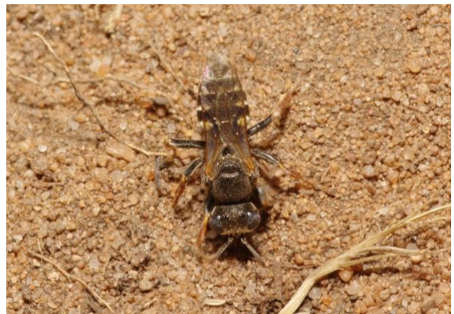
12. Oxybelus uniglumis (female) excavating a burrow at Devil's Spittleful on 30.06.2018.

Sericomyia silentis (Dip: Syrphidae). I was surprised to encounter two females visiting ivy flowers at St. Peters church in Martley on 28.09.2018.