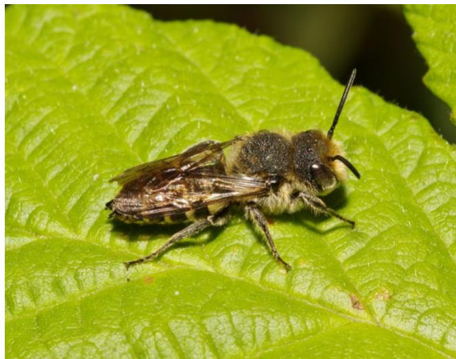
15. Coelioxys inermis (male) at St. Peters Church, Martley on 21.06.2018.

One collected from a low wall at St. Peters church in Martley on 21.06.2018.