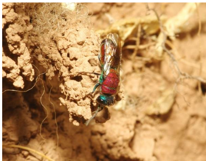
16. Chrysis viridula (female) inspecting a 'chimney' created by Odynerus spinipes at Lambswick Orchard on 01.07.2018.

Two females were observed on an up-turned root-plate of a dead Damson tree during the Worcestershire Recorders field visit to Lambswick Orchard, Lindridge on 01.07.2018. C. viridula is a kleptoparasite of Odynerus spinipes , a potter wasp in the family Vespidae. O. spinipes is commonly known as the 'chimney' potter wasp because of the curious chimney-type structures the females construct at their nest-entrances. Up-turned root-plates of fallen trees provide ideal habitat where O. spinipes can find the right consistency of clay-based soil particles among the roots to build their chimneys. These chimneys are actually difficult to find unless you happen to encounter either the adult potter wasp, or its striking kleptoparasite C. viridula . No adults of O. spinipes were seen but several chimneys were found on the root-plate. Both species are rare in Worcestershire in my experience.