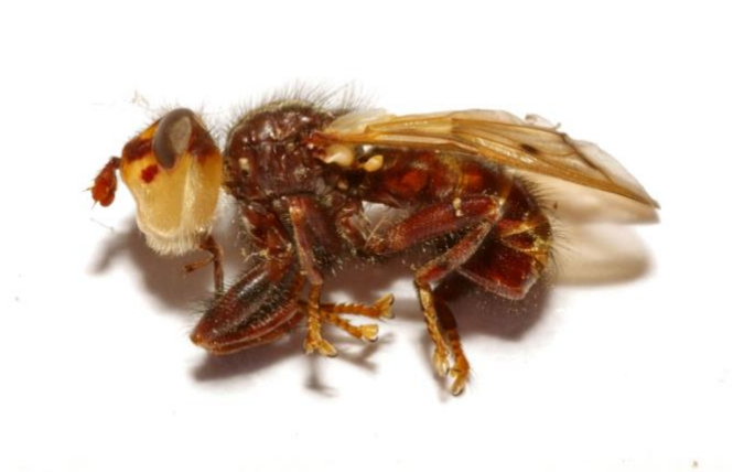
08. Myopa hirsuta from Devil's Spittleful on 25.04.2018.

One was collected from Blackthorn flowers at the Devil's Spittleful on 25.04.2018.