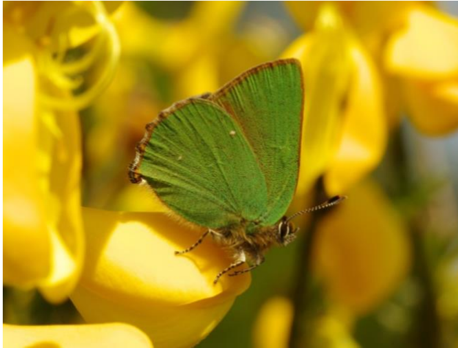
01. Green Hairstreak at the Devil's Spittleful on 05.05.2018.

Three freshly emerged adults were seen at the Devil's Spittleful on 5.05. 2018. They were all in the area immediately alongside the Severn Valley railway line among emergent Broom.