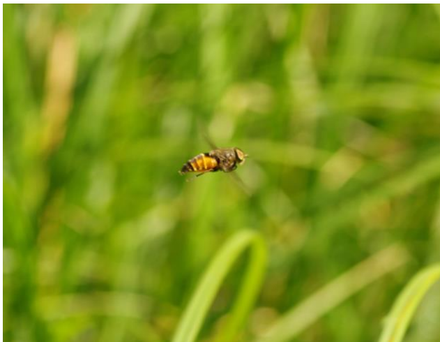
10. Hybomitra distinguenda (male) at the Mackeness Reserve, Wyre Forest on 23.06.2018.