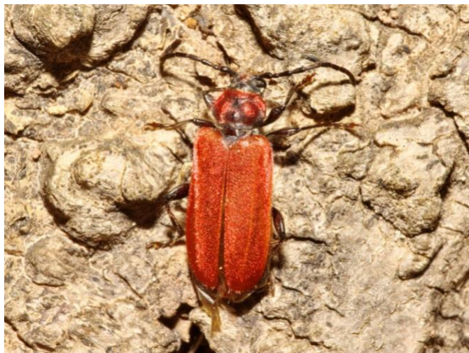
05. Pyrrhidium sanguineum on an oak log at the Shakenhurst estate on 28.05.2018.