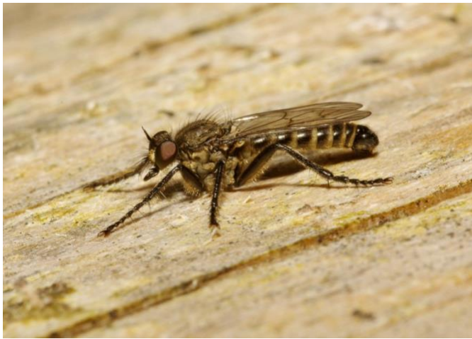
09. Lasiopogon cinctus at Devil's Spittleful on 05.05.2018.

Xanthogramma citrofasciatum (Dip: Syrphidae). One was seen briefly among ant-hills in a recently grazed area of the Devil's Spittleful on 05.05.2018. Up to five (males and females) were recorded in species-rich grassland with ant-hills alongside Lodge Hill Farm, Wyre Forest, on 19.05.2018.