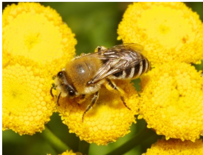
19. Colletes similis (female) visiting Tansy flowers at Devil's Spittleful on 21.07.2018.

I collected one of five females visiting Tansy flowers alongside the track leading beneath the Severn Valley Railway bridge into the Devil's Spittleful on 21.07.2018. This is my first Worcestershire record for this species.