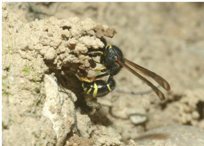
17. Odynerus spinipes (female) at her 'chimney' nest entrance. This was photographed at Bencroft Wood, Hertfordshire on 25.06.2012.