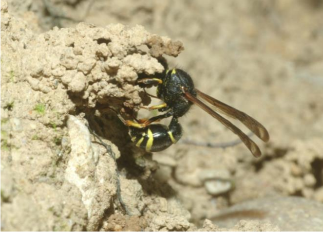
17. Odynerus spinipes (female) at her 'chimney' nest entrance. This was photographed at Bencroft Wood, Hertfordshire on 25.06.2012.