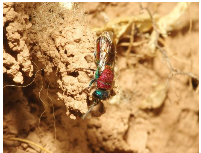
16. Chrysis viridula (female) inspecting a 'chimney' created by Odynerus spinipes at Lambswick Orchard on 01.07.2018.

Two females were observed on an up-turned root-plate of a dead Damson tree during the Worcestershire Recorders field visit to Lambswick Orchard, Lindridge on 01.07.2018. C. viridula is a kleptoparasite of Odynerus spinipes , a potter wasp in the family Vespidae. O. spinipes is commonly known as the 'chimney' potter wasp because of the curious chimney-type structures the females construct at their nest-entrances. Up-turned root-plates of fallen trees provide ideal habitat where O. spinipes can find the right consistency of clay-based soil particles among the roots to build their chimneys. These chimneys are actually difficult to find unless you happen to encounter either the adult potter wasp, or its striking kleptoparasite C. viridula . No adults of O. spinipes were seen but several chimneys were found on the root-plate. Both species are rare in Worcestershire in my experience.