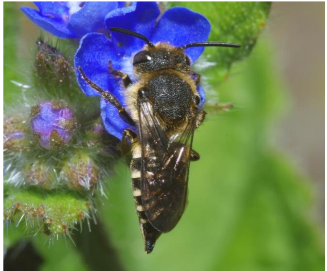
09. Coelioxys rufescens female at Martley on 16.06.2017.

Coelioxys rufescens (Hym; Megachilidae). One female was collected from flowers of Green Alkanet Pentaglottis sempervirens at the church wall on 16.06.2017. This is a cleptoparasite of the leaf-cutter bee Megachile willughbiella , but also parasitizes Anthophora furcata (BWARS, 2017).