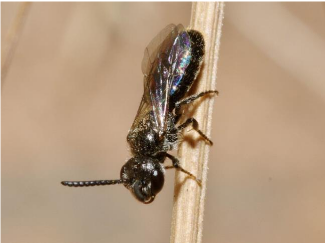
16. Sphecodes niger male at Martley on 05.07.2017.