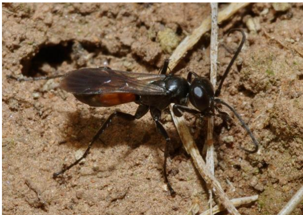
11. Evagetes crassicornis female at Martley on 26.09.2017.

Evagetes crassicornis (Hym; Pompilidae). One female was collected from the low wall at Martley church on 26.09.2017. This rather small spider-hunting wasp is a cuckoo of other pompilids but there are still gaps surrounding the knowledge of this species. It is thought to parasitize Anoplius nigerrimus and/or Arachnospila anceps (BWARS, 2017). Both are considered widespread and common and I have recorded both species from the wall at Martley church on several occasions. It is always particularly satisfying to capture a decent image of a spider-hunting wasp and collect it for correct identification later as they move very rapidly and erratically through often dense vegetation close to the ground.