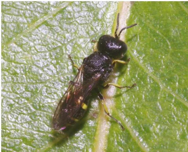
10. Ectemnius rubicola female at Martley on 15.06.2017.

Evagetes crassicornis (Hym; Pompilidae). One female was collected from the low wall at Martley church on 26.09.2017. This rather small spider-hunting wasp is a cuckoo of other pompilids but there are still gaps surrounding the knowledge of this species. It is thought to parasitize Anoplius nigerrimus and/or Arachnospila anceps (BWARS, 2017). Both are considered widespread and common and I have recorded both species from the wall at Martley church on several occasions. It is always particularly satisfying to capture a decent image of a spider-hunting wasp and collect it for correct identification later as they move very rapidly and erratically through often dense vegetation close to the ground.