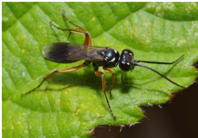
02. Agenioideus cinctellus female at Martley on 04.09.2017.