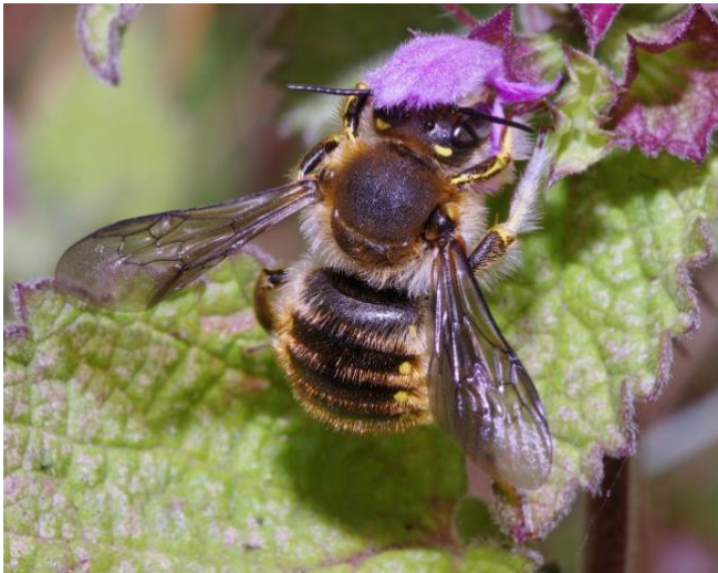
06. Anthidium manicatum male at Martley on 27.06.2017.

Anthidium manicatum (Hym; Megachilidae) Wool Carder Bee. Up to three males were regularly seen visiting flowers of Black Horehound Ballota nigra on several dates between 19.06.2017 and 04.09.2017.