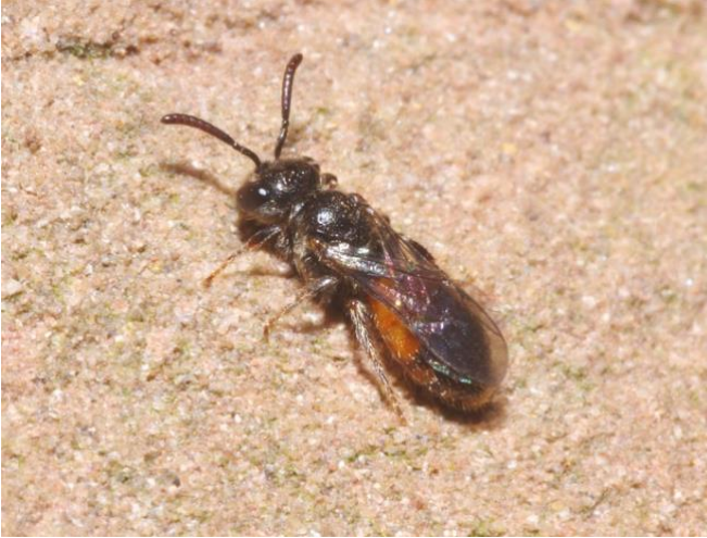
15. Sphecodes niger female at Martley on 13.07.2017.