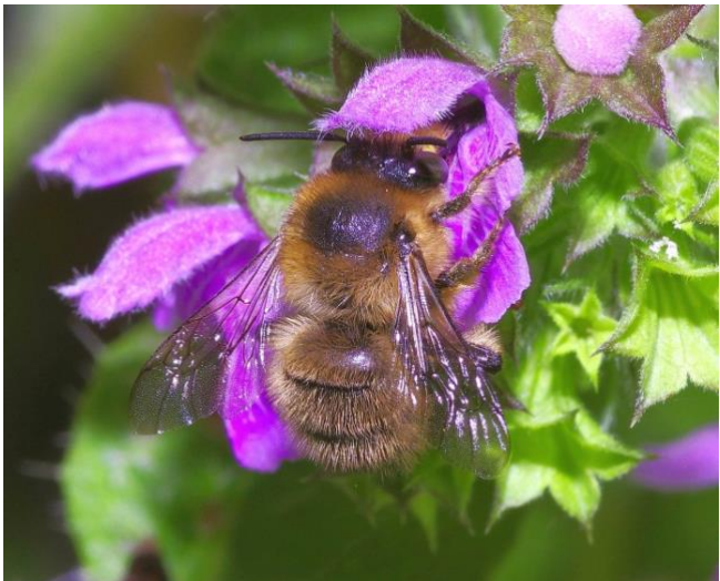
07. Anthophora furcata female at Martley on 22.06.2017.

Anthophora furcata (Hym; Apidae). Up to two were regularly seen visiting flowers of Black Horehound Ballota nigra on several dates between 22.06.2017 and 07.07.2017. This widespread but generally uncommon species is most often recorded visiting Lamiaceae between June and July (BWARS, 2017).