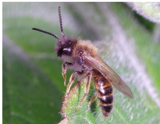
05. Andrena trimmerana male at Martley on 21.03.2017.

Andrena trimmerana (Hym; Andrenidae) Notable B. One male was photographed at the church wall on 21.03.2017. A bivoltine species most often recorded sparingly from steep banks and slopes where they nest singly in a variety of habitats (BWARS, 2017).