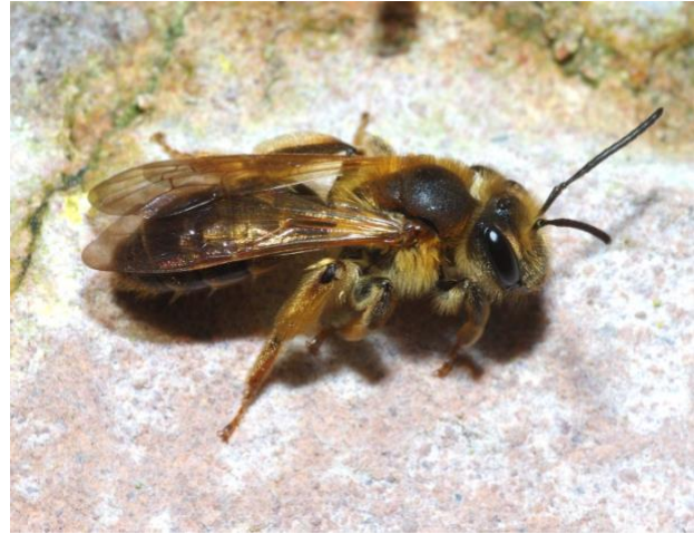
03. Andrena bucephala female at Martley on 13.04.2017.