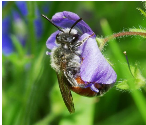
04. Andrena labiata male at Martley on 23.05.2017.

One male visiting flowers of Germander Speedwell Veronica chamaedrys at the millennium green alongside the church on 23.05.2017. It is well worth inspecting flowering patches of speedwells during mid to late May for this distinctive mining bee which is possibly undergoing an increase in its geographical range.