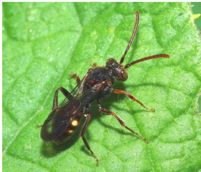
14. Nomada hirtipes female at Martley on 18.05.2017.