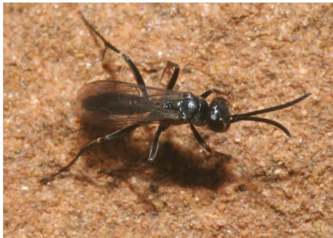
01. Agenioideus cinctellus male at Martley on 16.06.2017.