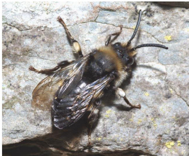
13. Melecta albifrons male at Martley on 31.03.2017.

Melecta albifrons (Hym; Apidae). One or two were regularly seen visiting flowers of Green Alkanet Pentaglottis sempervirens at the church wall between 28.03.2017 and 18.04.2017. This is a cleptoparasite of Anthophora plumipes and A. furcata (BWARS, 2017).