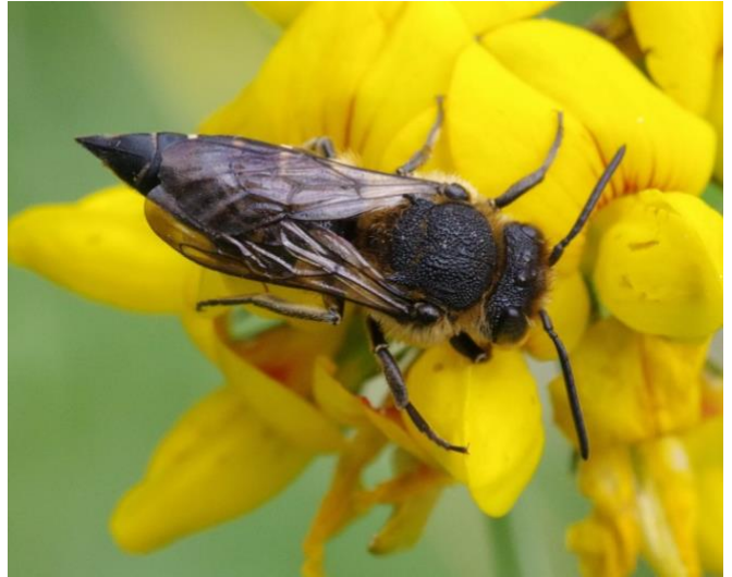
08. Coelioxys elongata female at Martley on 14.07.2017.

Coelioxys elongata (Hym; Megachilidae). One female was collected on 14.07.2017 from flowers of Greater Bird's-foot Trefoil Lotus pedunculatus at the millennium green alongside the church. This is a cleptoparasite of the leaf-cutter bee Megachile willughbiella and although nationally widespread in a variety of habitats it is considered rare in the midlands. C. elongata is fond of bird's-foot trefoil species and melilot species (BWARS, 2017).