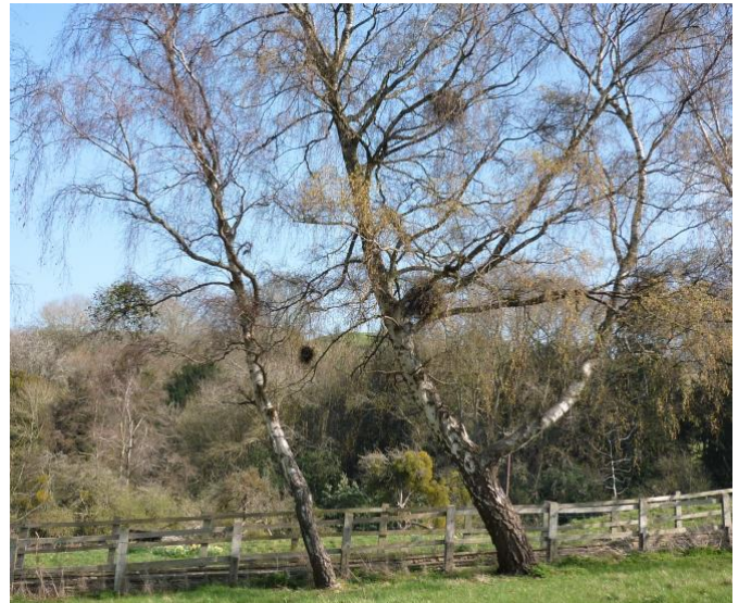
01. Birch with mistletoe of left, birch with Brooms on right

Birch trees are not uncommon in the area as they are widely planted in gardens, along streets and in amenity areas. Brooms were found on only seven trees in the whole of the area despite an estimated 1200 trees having been seen. These seven are listed in Table 1. Mistletoe Viscum album on birches was even rarer, only two affected trees being seen. Bizarrely, one of these stood next to a tree with brooms in a group of ten, otherwise unaffected, birch trees along a drive to a bungalow near Woollas Hall at SO94644046 (01). The chance of this occurring works out as somewhere in the order of 1 in 100,000!