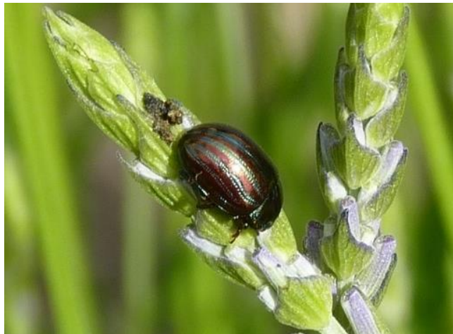
01. Rosemary Beetle Chrysolina americana feeding on lavender Lavandula sp. Moseley, Birmingham.

In late June, the 27 th in fact, the lavender was flowering well and so I was not surprised when I was told by my eight-year old neighbour of an unusual looking insect she had seen feeding on the flowers. As I approached the lavender my first thought, given the insect's shape, was that it might be a ladybird, but closer inspection soon quashed that idea. It was time to take a photograph so that I could scrutinise the insect in more detail. As (01) shows, the metallic green shell is lined with red stripes punctured with dots, and it was very much a new insect to me. Research on the internet (my reference material does not include this relatively new beetle to the UK) soon revealed the facts: it was a Rosemary Beetle Chrysolina americana an insect from southern and eastern Europe first recorded in UK in 1994 at Royal Horticultural Society (RHS) Wisley, Surrey. It has gradually moved north and is currently well north of VC 37 (02). The Rosemary Beetle is a pest and can damage a number of aromatic plants if not dealt with – sage, thyme, rosemary AND lavender - and there were at least a dozen on my plants already!!