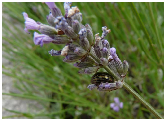
03. Chrysolina americana in Stourbridge August 2015. B Westwood

On 6 th August 2015 Brett Westwood found and photographed (03) a single Rosemary Beetle on Lavender in St Thomas' churchyard in the centre of Stourbridge, West Midlands.