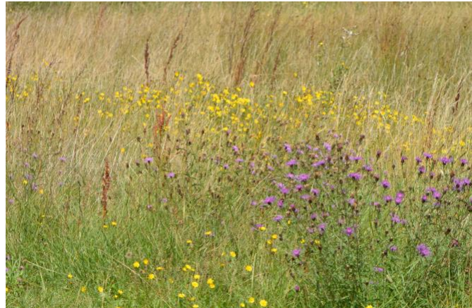
The Hawthorns. Rough grassland 05 August 2017