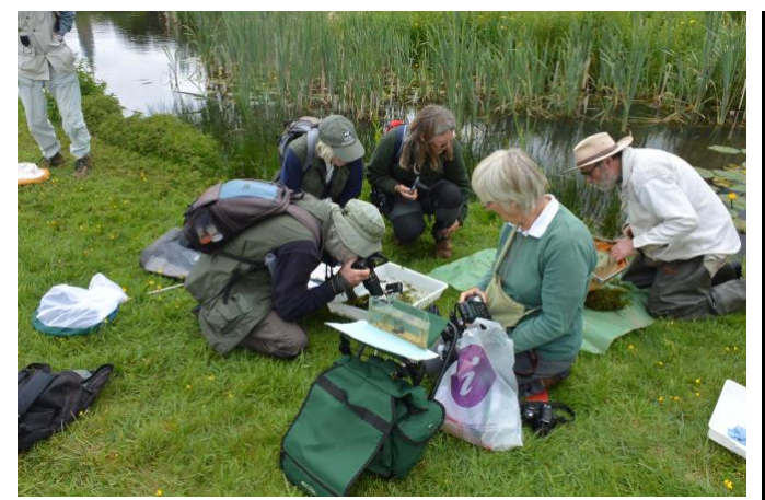
Kyre Park recording group at top lake 03 June 2017