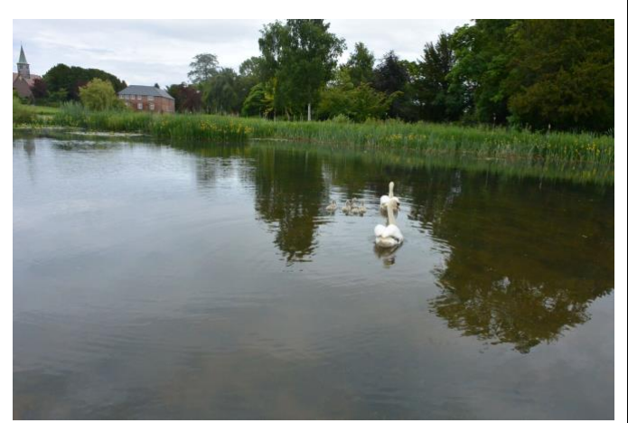
Kyre Park top lake 03 June2 018