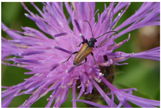
Hardwick Green Pseudovadonia livida Fairy ring longhorn 01 July 2017

Saturday 1<sup>st</sup> July 2017. Land near Hardwick Green, Eldersfield. Managed and being acquired by Worcestershire Wildlife Trust who gave us permission to visit. Important herb-rich flood plain grasslands, old hedges, ditches, streams.