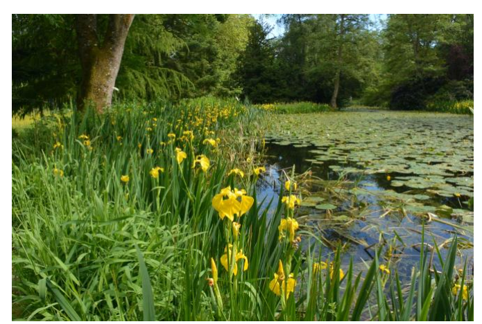
Kyre Park middle pool 03 June 2017

Saturday 1<sup>st</sup> July 2017. Land near Hardwick Green, Eldersfield. Managed and being acquired by Worcestershire Wildlife Trust who gave us permission to visit. Important herb-rich flood plain grasslands, old hedges, ditches, streams.