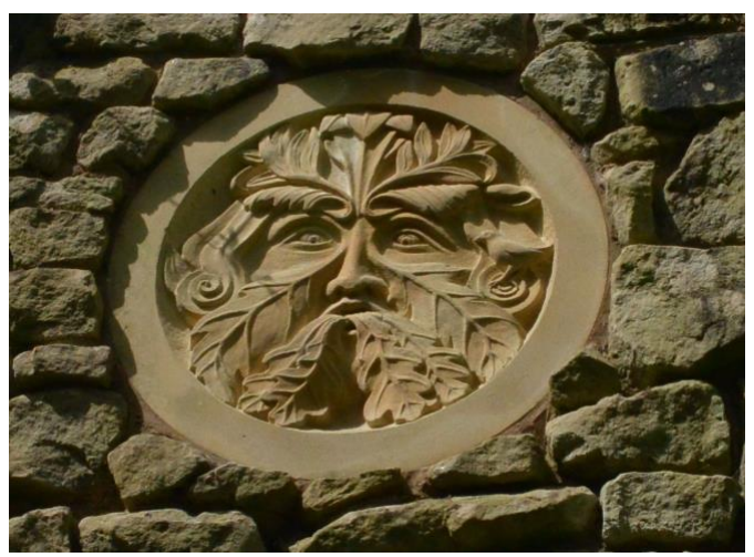
Kyre Park sculpture four 03 June 2017