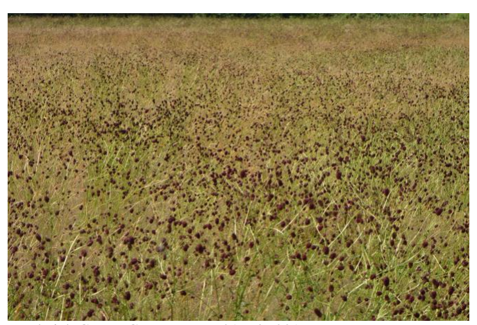
Hardwick Green, Great Burnet 01 July 2017