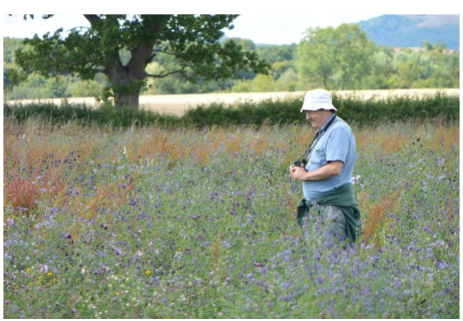
The Hawthorns legume field with recorder 05August 2017