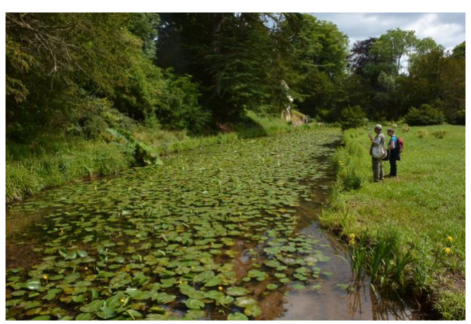
Kyre Park lower Lake 03 June 2017