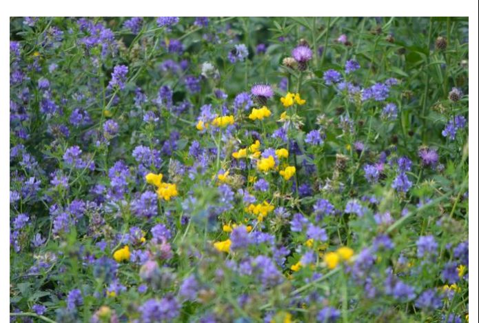
The Hawthorns legume field 05 August 2017