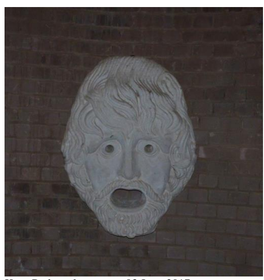
Kyre Park sculpture two 03 June 2017