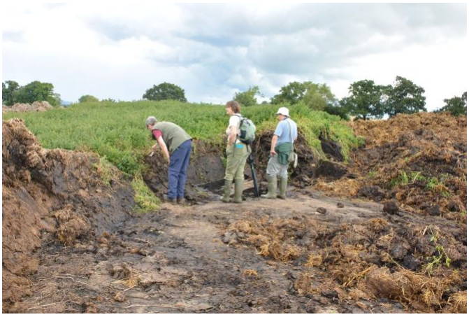
The Hawthorns. Muck heaps always attract biological recorders 05 August 2017