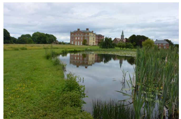
Kyre Park top lake 03 June 2018