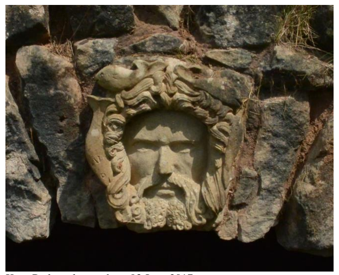
Kyre Park sculpture three 03 June 2017