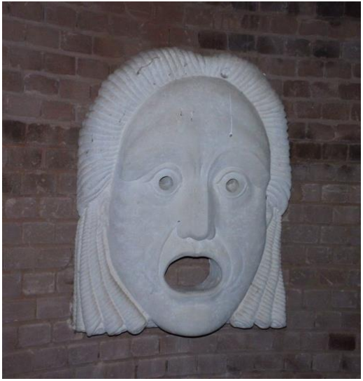
Kyre Park sculpture one 03 June 2017