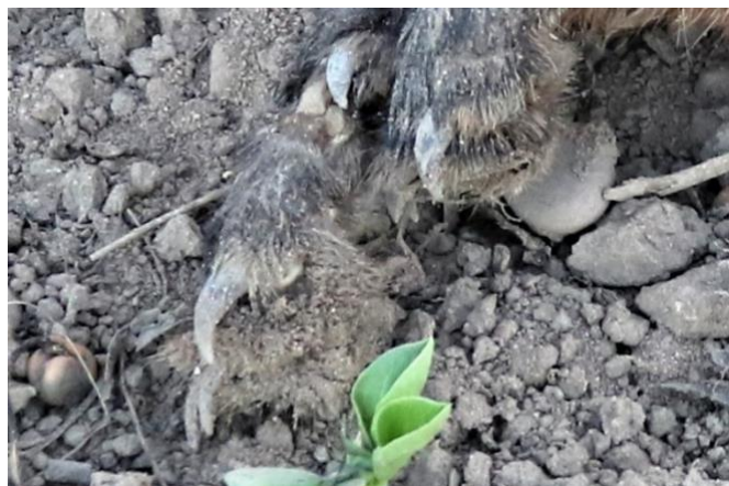
03. Close up of feet showing claws.