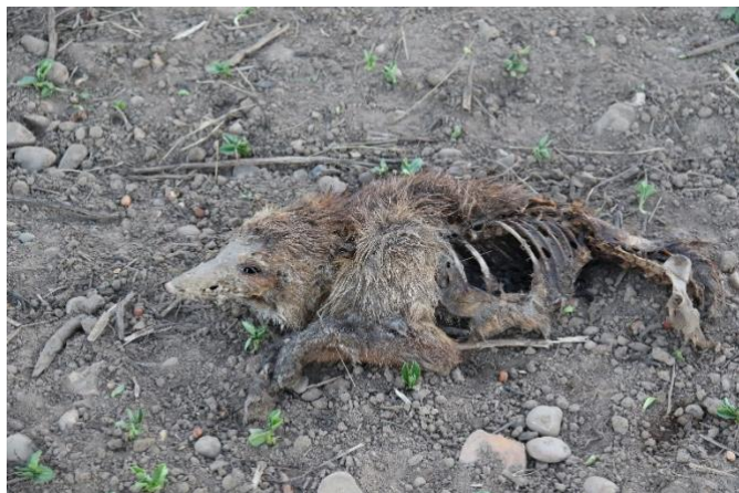
01. Animal remains near Pershore. October 2021. Wendy Berry.

Raccoon Dogs Nyctereutes procyonoides (also known as 'tanuki') are members of the canid (dog) family and are native to the forests of eastern Siberia, northern China, North Vietnam, Korea and Japan. They are now widespread in some European countries, having been accidentally released or escaped. These little 'dogs' are omnivores and will eat insects, rodents, amphibians, birds, fish, molluscs and carrion, as well as fruits, nuts and berries. They are considered to be a risk to native fauna in Europe and are highly invasive (RSPB website).