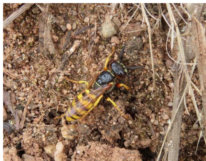
14. Bee Wolf Philanthus triangulum female. Wild Goose training site. 03/08/2019. Rosemary Winnall.