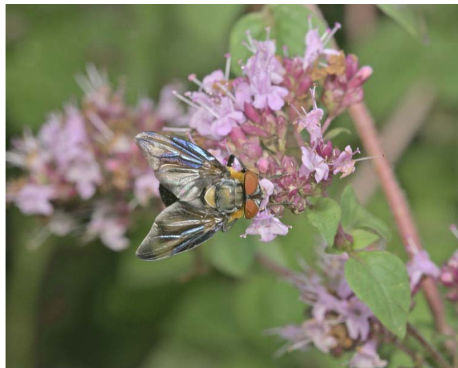
15. Tachinid fly Phasia hemiptera . Wild Goose training site. 03/08/19. Roger Plant.