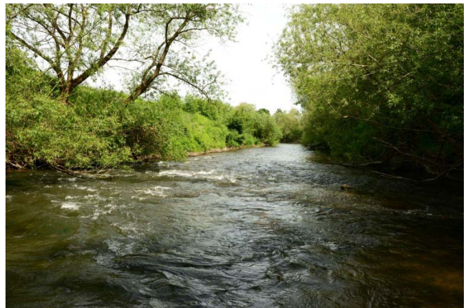
04. River Teme at the Fold, Bransford 06/01/19.