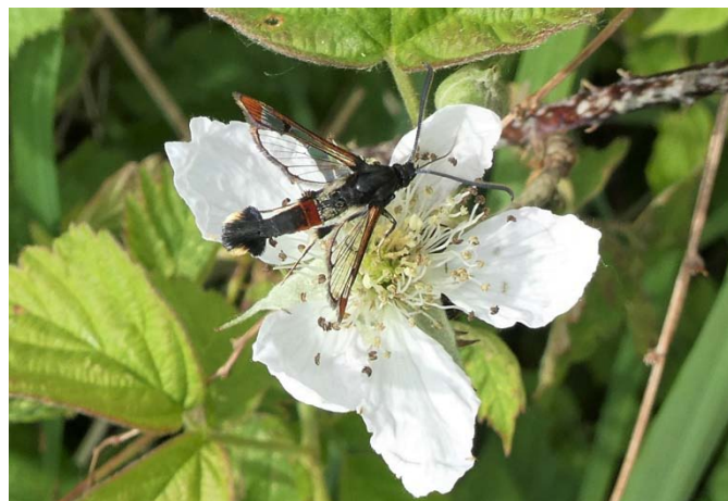
02. Red-tipped Clearwing Moth Synanthedon formicaeformis at the Fold. 01/06/19. Nicki Farmer.