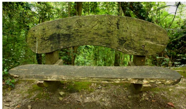
09. Welcome to our Future Severn Waste Services seat Crews Hill Wood Recording day 06/07/19. Harry Green.

Saturday 3rd August 2019. The Wild Goose Rural Training site, Ball Mill Quarry near Grimley. About 33 acres of old settling pools from a former Lafarge Tarmac quarry with reedbed, shallow water, extensive willow scrub and open sandy ground. Number of attendees – 23. Number of species recorded – 325