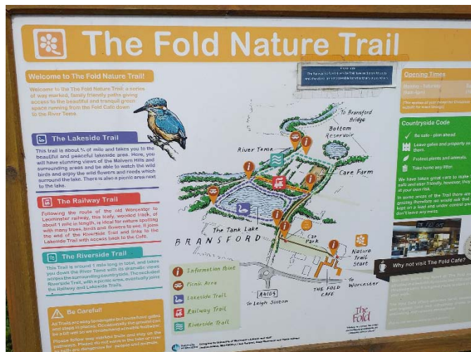
01. Interpretation board at The Fold. 01/06/19. Nicki Farmer.