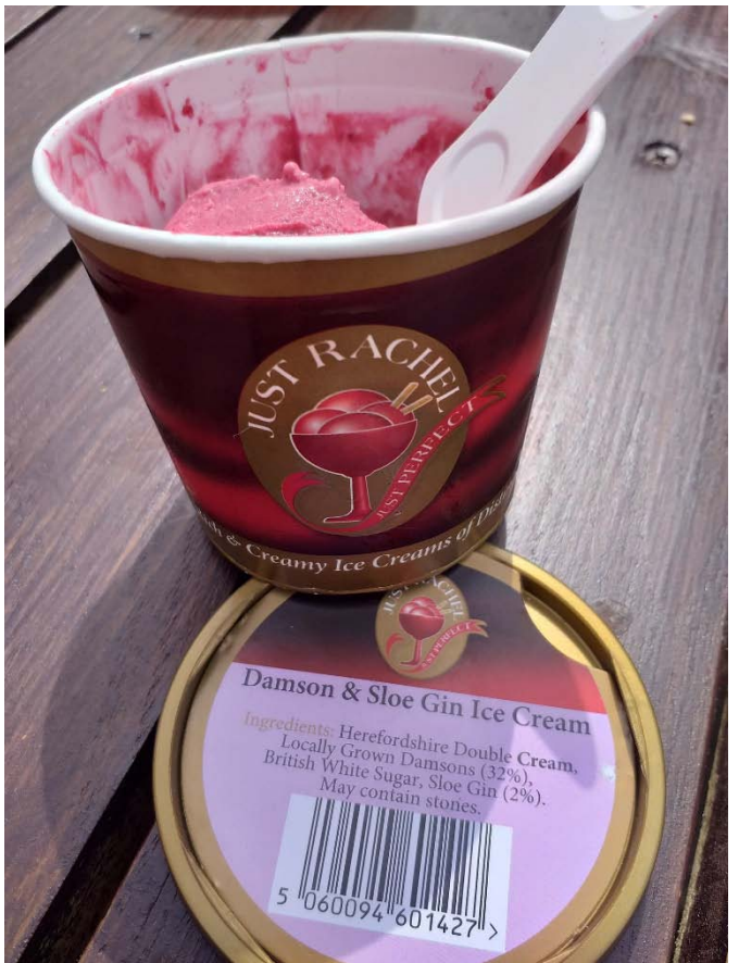
05. Sloe Gin Ice Cream at The Fold. The perfect end to an excellent recording day (other brands may be available). 01.06.19. Nicki Farmer.