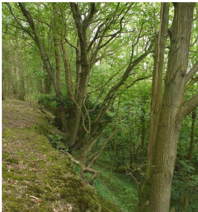
07. Crews Hill Wood 06/07/19 recording day. Harry Green.