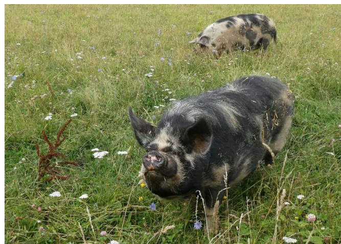
11. Some rather curious residents of Wild Goose Training site. 03.08.19. Nicki Farmer.