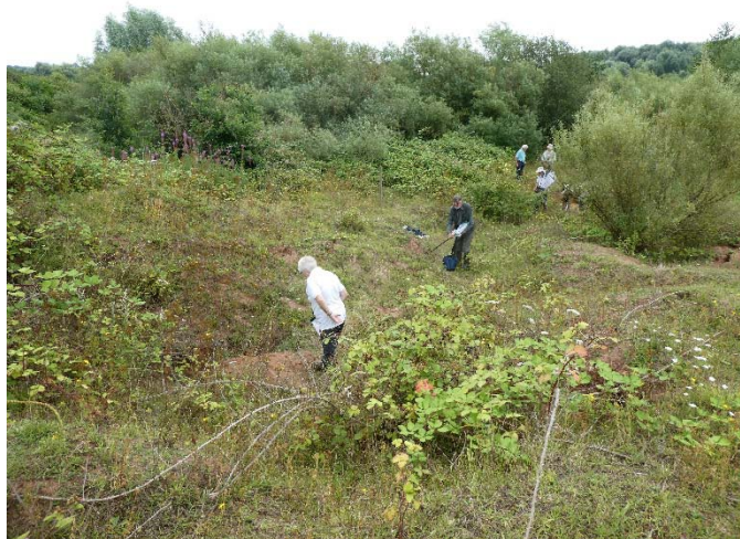
12. Exploring the open sandy ground at Wild Goose Training site. 03.08.19. Nicki Farmer.