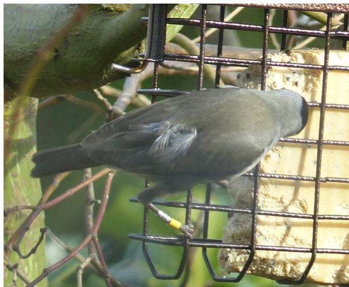
03. Malvern Blackcap with geolocator caught in Gloucester. Gordon Kirk