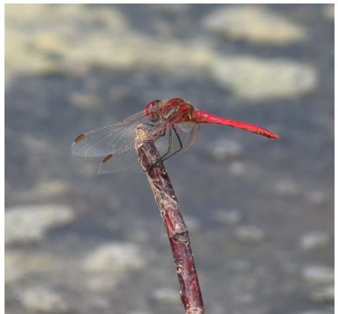
02. Red-veined Darter Sympetrum fonscolombii male.