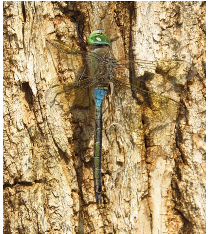
01. Lesser Emperor Anax parthenope male.

At Hartlebury Common, other than at Hillditch Pool, was a disappointing year with the dry warm weather not helping freshwater invertebrates as the two water bodies, the Bog and Rush Pool both went dry quite early in the year.