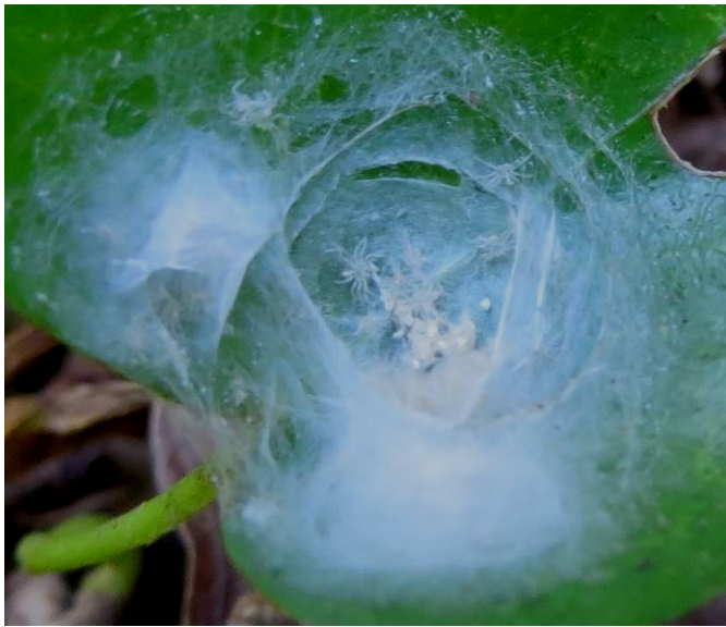
23. Nigma walckenaeri . Web with spiderling moulted skins.

I had anticipated that my Nigma sightings would have finished for this year by now (early December) as when the temperature dropped numbers decreased significantly. I was only seeing the odd one or two and in mid November, after a hard frost and a couple of cold days I didn't see any. However as it has warmed up again (14°C 02/12/15) I have started to see both sexes again, including a female catching a fly.