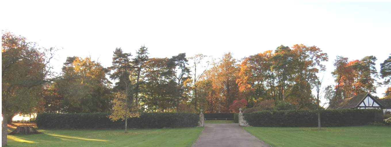
02. Ivy covered wall where many observations of Nigma walckenaeri were made.