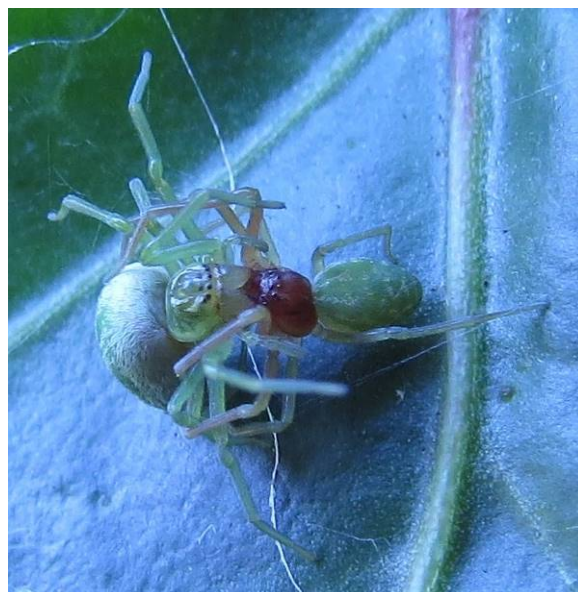
17. Nigma walckenaeri mating. Female gripping male chelicerae