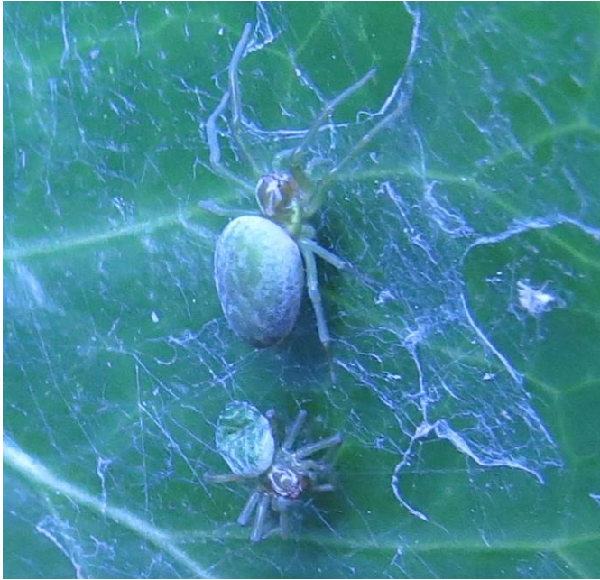
10. Nigma walckenaeri female with another smaller female as prey