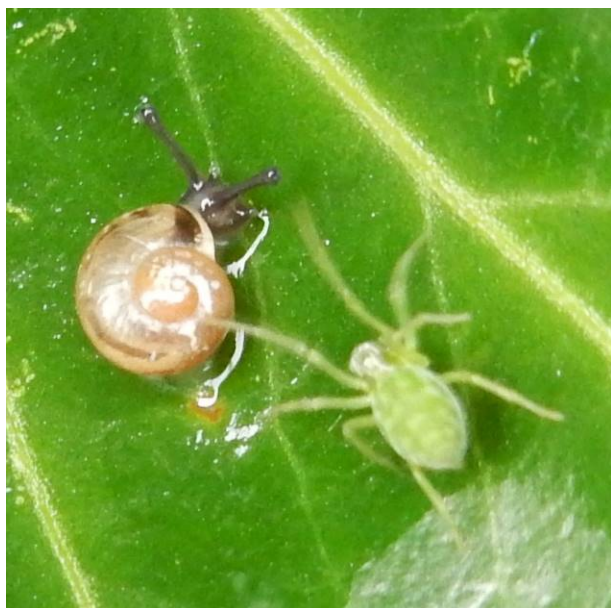
15. Nigma walckenaeri female with snail

I saw quite a few face to face meetings between male and female where they had a tussle while the male tried to persuade the female that he was a possible mate rather than a meal. From time to time a female was courted by two males; sometimes the males wrestled in the vicinity of the female. Occasionally there was a three-way wrestling match including the female but inevitably one of the males eventually sloped off defeated, but alive.