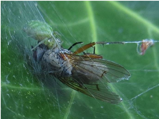
11. Nigma walckenaeri female with large fly