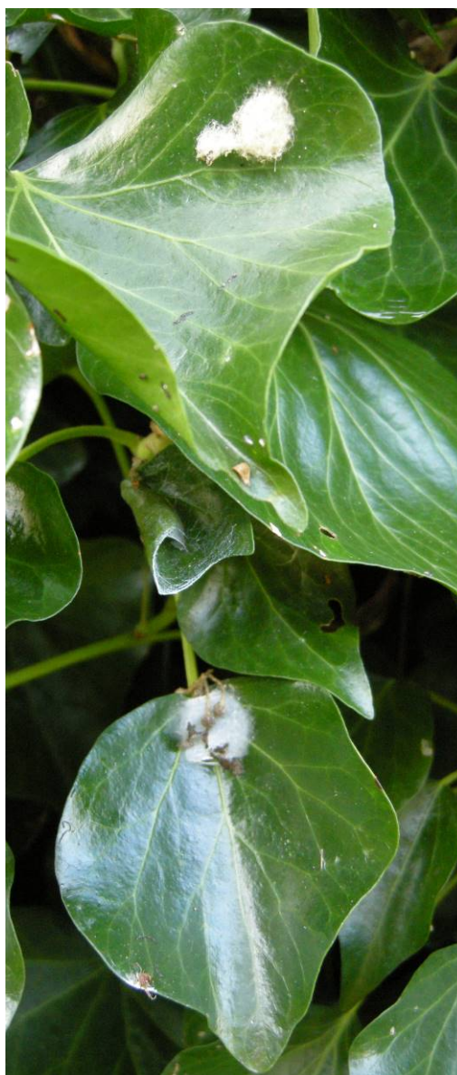
01. Nigma walckenaeri egg sacs and webs