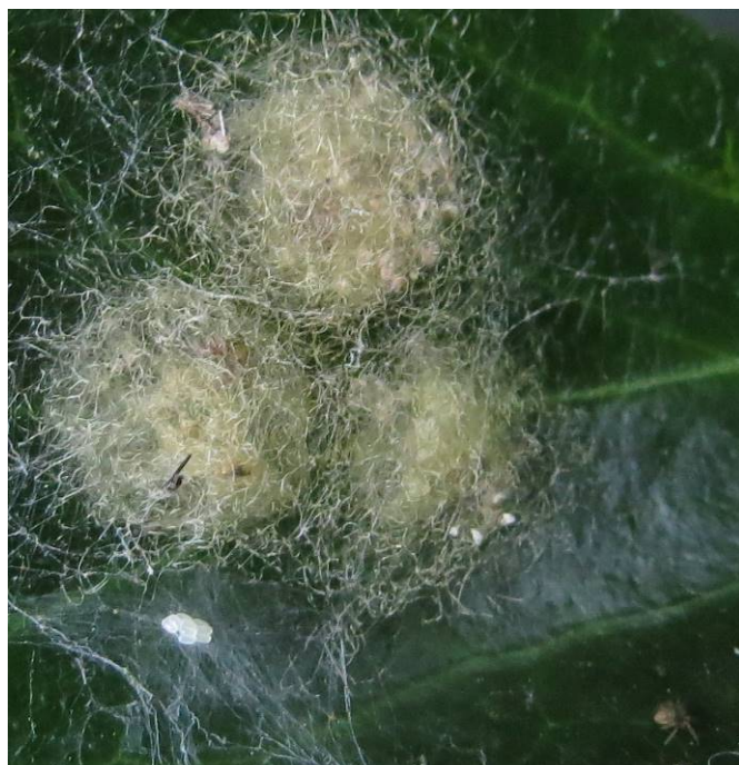
21. Nigma walckenaeri . Trio of egg sacs with small capsule eggs below and spiderling exiting bottom right