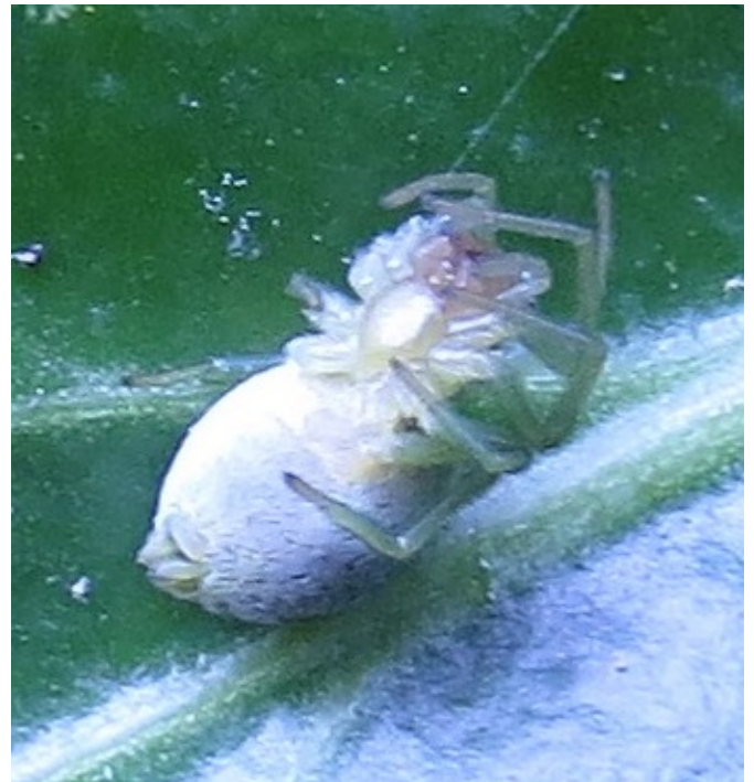
05. Underside of Nigma walckenaeri