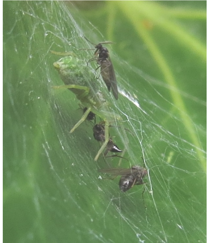
12. Nigma walckenaeri female with abundance of prey