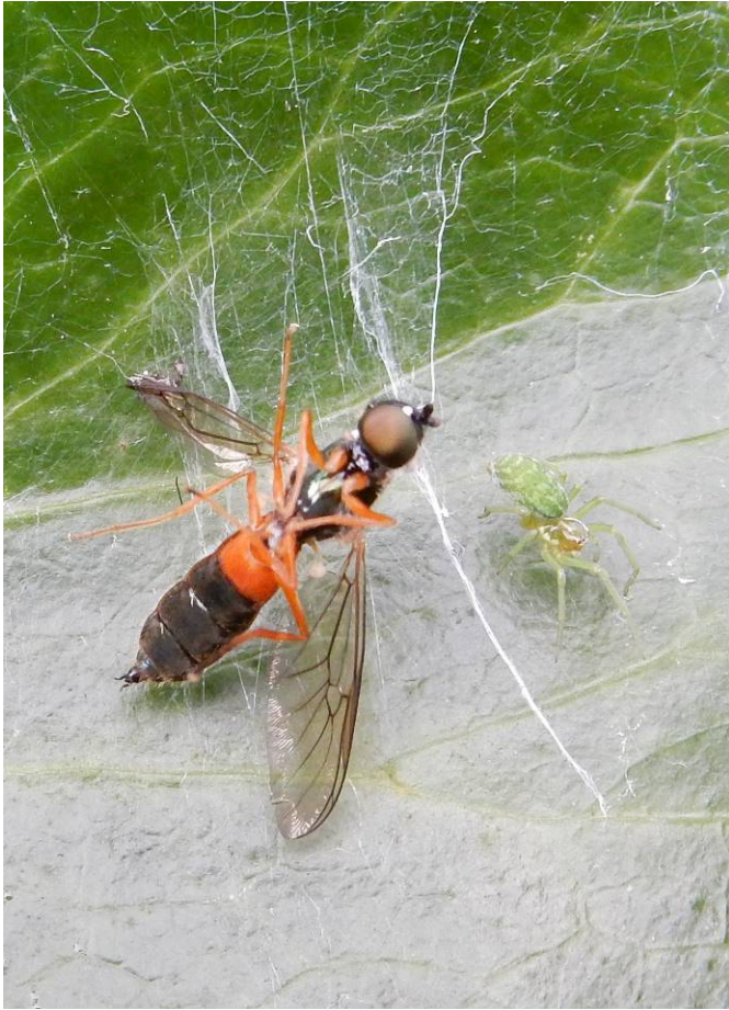
06. Female Nigma walckenaeri with soldierfly Sargus bipunctatus prey