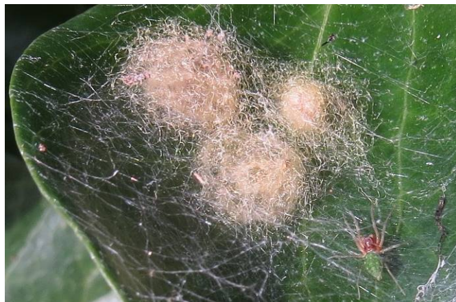
20. Nigma walckenaeri male by egg sacs

I have seen many egg sacs while studying the ivy but couldn't be certain that they were produced by Nigma walckenaeri spiders. The ones that I suspect are most likely look like a fibrous cotton wool ball, on a few occasions I have seen the both male (20) and female (at different times) next to these egg sacs and a female with a retreat adjacent to the egg sac. I found a trio of egg sacs on one leaf which had an edge curled over sheltering the sacs on 4 th October 2015 (21). As I didn't know when the egg sacs were created, how long the eggs would take to hatch, whether they would overwinter or had already hatched I thought it worth checking them regularly. I now have over 50 photos of these egg sacs and only two spiderling sightings (24/10/15 and 04/11/15). An interesting development with these egg sacs was a clutch of 10 small white shiny capsule shaped eggs laid next to the egg sacs in early November, was this coincidental or could it be eggs of a spider parasite? Since mid November I have started to see some flat sheet webs appearing with what look like possible egg clusters below the surface (22), I saw a similar web in April that had many spider moulted skins (23) in it, but again I can't be completely sure what species of spider they belong to.