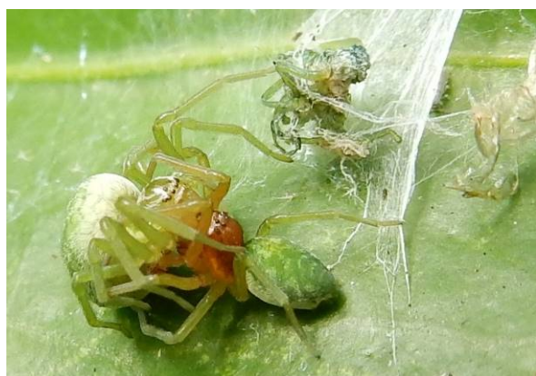
19. Nigma walckenaeri mating pair with remains of spider in web behind

I watched spiders spinning their webs on a few occasions and while trying to photograph and video them soon found that they were sensitive to disturbance while spinning and would stop at the slightest knock of the leaf. Quite different to when they were mating and you could get very close without disturbing them.