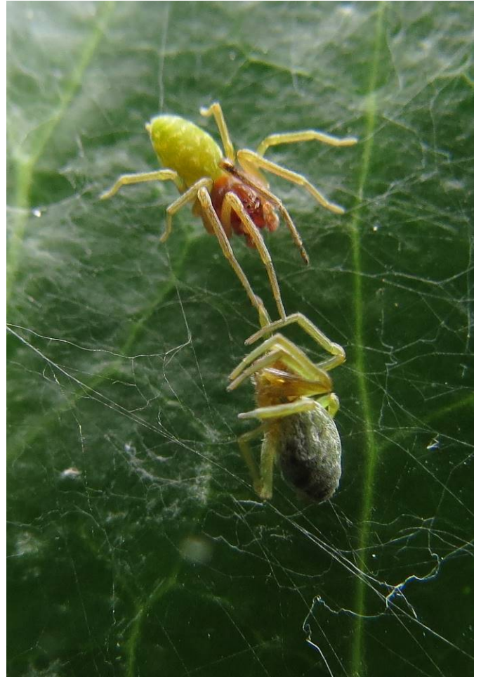
08. Male Nigma walckenaeri capturing female Nigma walckenaeri as prey