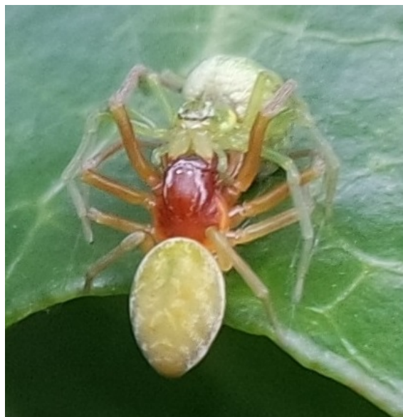
16. Nigma walckenaeri mating. Female gripping male chelicerae.

From mid September to early November I found mating pairs almost every time I checked the ivy. The female generally held her abdomen perpendicular to the leaf, faced by the male holding his body at a similar angle. The chelicerae (“jaws”) of the male were held near the base within the female’s chelicerae (16, 17, 19). Locket & Millidge (1951) state that the males have a swelling near the base of the chelicerae and when these are gripped by the female the pair are fixed in the correct position for him to pass over his sperm using a palp. I don’t know how long they remain in this position but on a couple of occasions when I checked back half an hour later they were still in place. In one of my pictures of a mating pair I was intrigued to see what appeared to be a translucent orb between the male and female just at the back of the male’s palp (18). Dr. Geoff Oxford (pers com) of www.britishspiders.org.uk kindly clarified that this was the haematodocha, the part of the male palp that is elastic and expands and collapses repeatedly as sperm is transferred to the female storage organs.