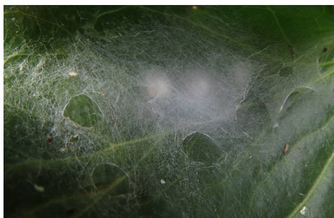
22. Nigma walckenaeri . Sheet webs with possible egg clusters below