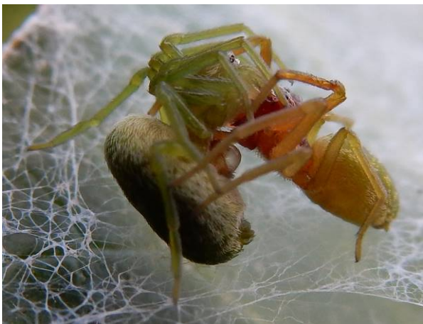
18. Nigma walckenaeri mating pair showing transfer of sperm via palp. Note translucent dome-shaped haematodocha.