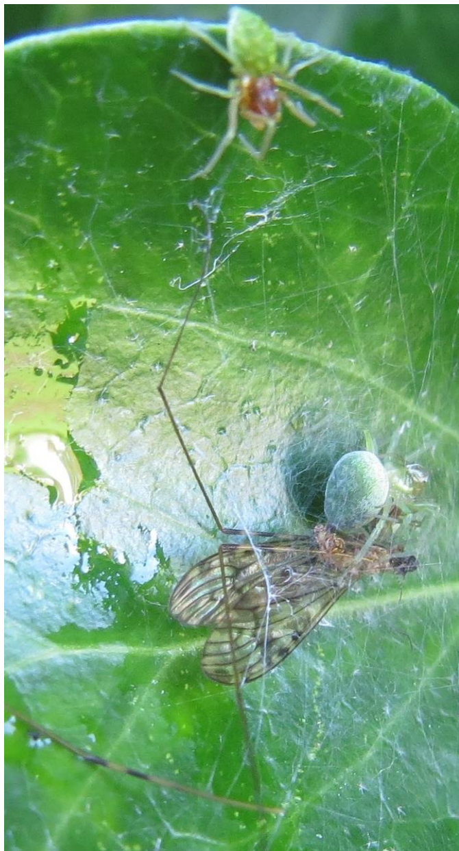
14. Nigma walckenaeri female with limoniid crane fly, Limonia nubeculosa prey, male moving in