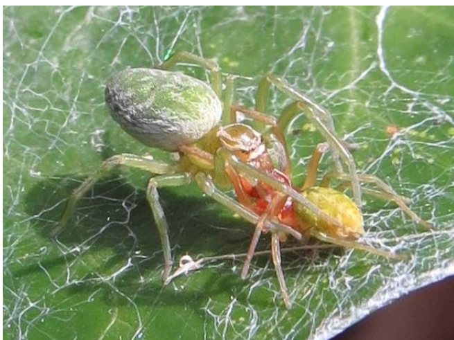
04. Nigma walckenaeri male (R) and female showing colour difference

The females are significantly bigger than the males and are fairly easily distinguishable from the male by their colour differences (04). Both sexes have some white hairs on their green abdomen giving them a 'frosted' appearance. In some cases a subtle variation in colour was noticeable as the abdomen of the females was a slightly duller minty green whereas some of the males were a brighter yellowish/limey green. The males have a rust coloured cephalothorax (the combination of head and thorax) and I noticed their legs tend to have a pinkish tinge, in some cases on all the legs and in others just the ones towards the front. On the few occasions that I've seen the underside of the spider it was white (05).