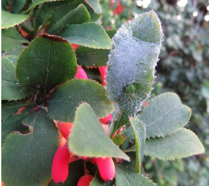
03. Nigma walckenaeri female on Berberis

just a few spiders but as I continued to watch I was easily finding dozens in a fairly small area so the wall must support a good sized population. Initially it appeared that all the spiders were to be found on the east facing side of the wall, however I did eventually find them on the west facing side although not in such abundant numbers. Mature ivy provides excellent habitat for the spiders but they can also be found on other shrubs and trees that have suitable leaves (with upturned edges). I have found them locally on Privet ( Ligustrum , Berberis sp (03), Cotinus coggygia and Elder Sambucus nigra although only in small numbers.