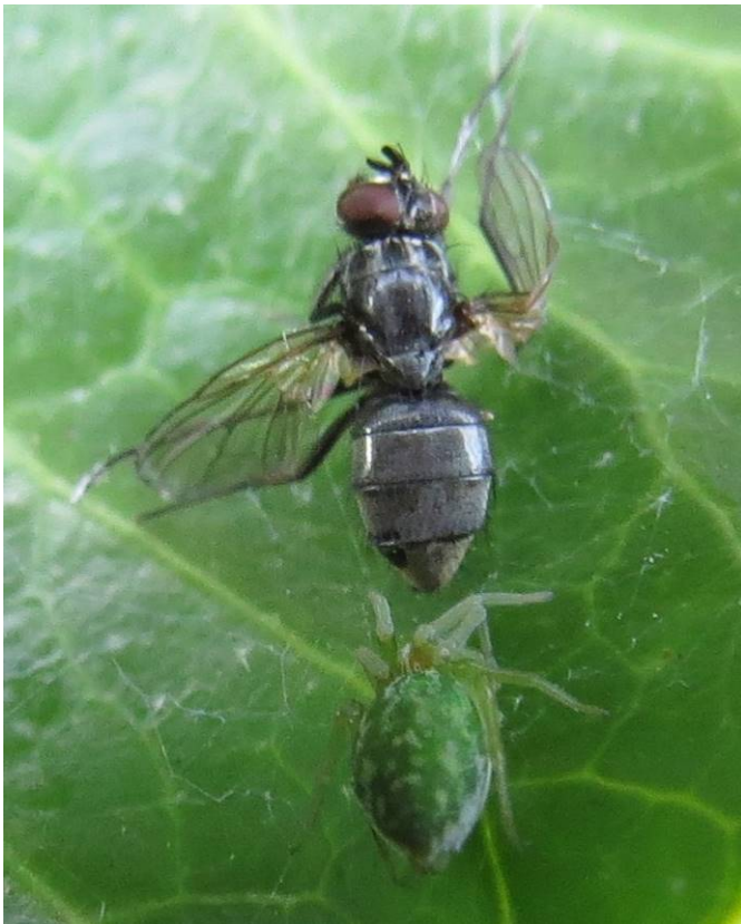
07. Female Nigma walckenaeri with fly.